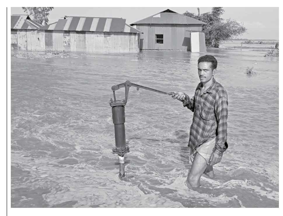
Char Mantala in Kurigram's Chilmari upazila goes into the Brahmaputra river, leaving 128 families landless and homeless.

this year than previous years, he added. They have already prepared lists of 1,600 local peanut farmer families for distributing the government incentives among them, said the agriculture officer.