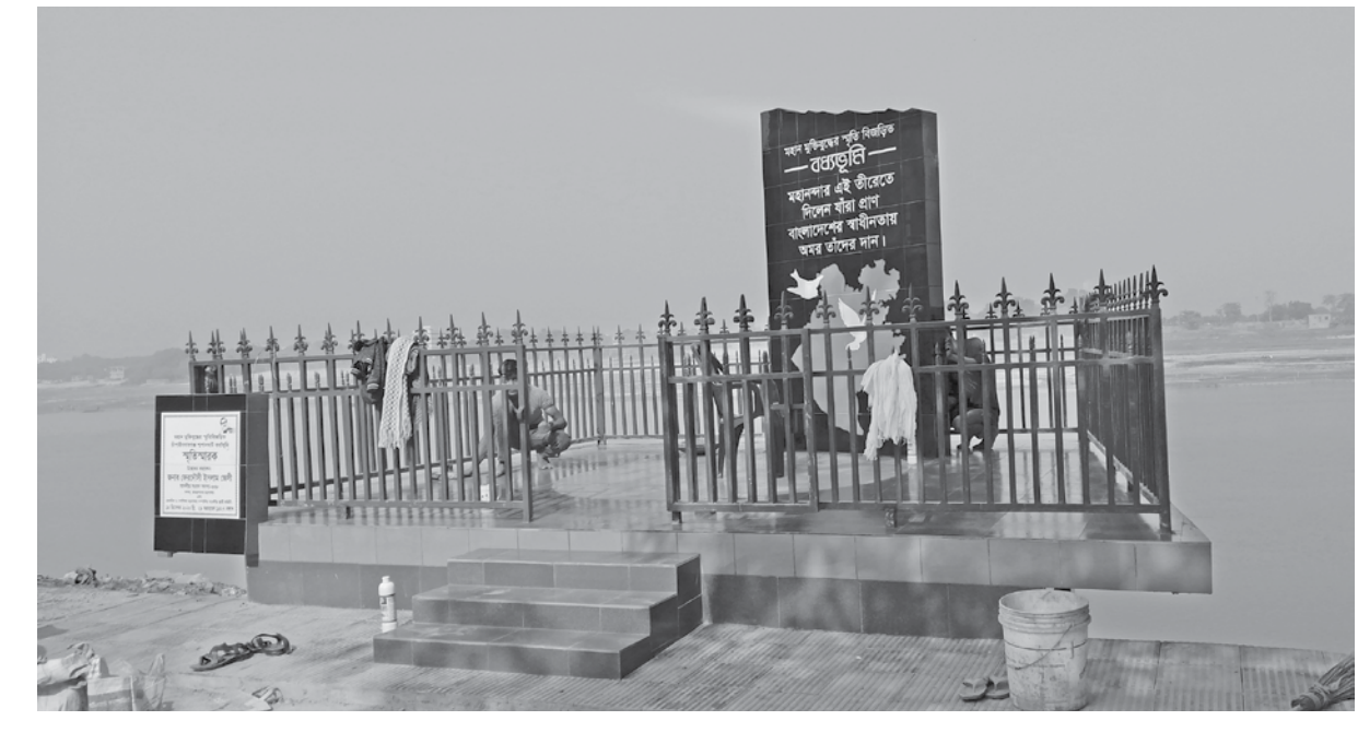
This memorial for martyrs, built at the mass graveyard in Rehaichar area along the Mahananda river in Chapainawabgani municipality, is expected to be inaugurated on December 14.

Pabna University of Science & Technology