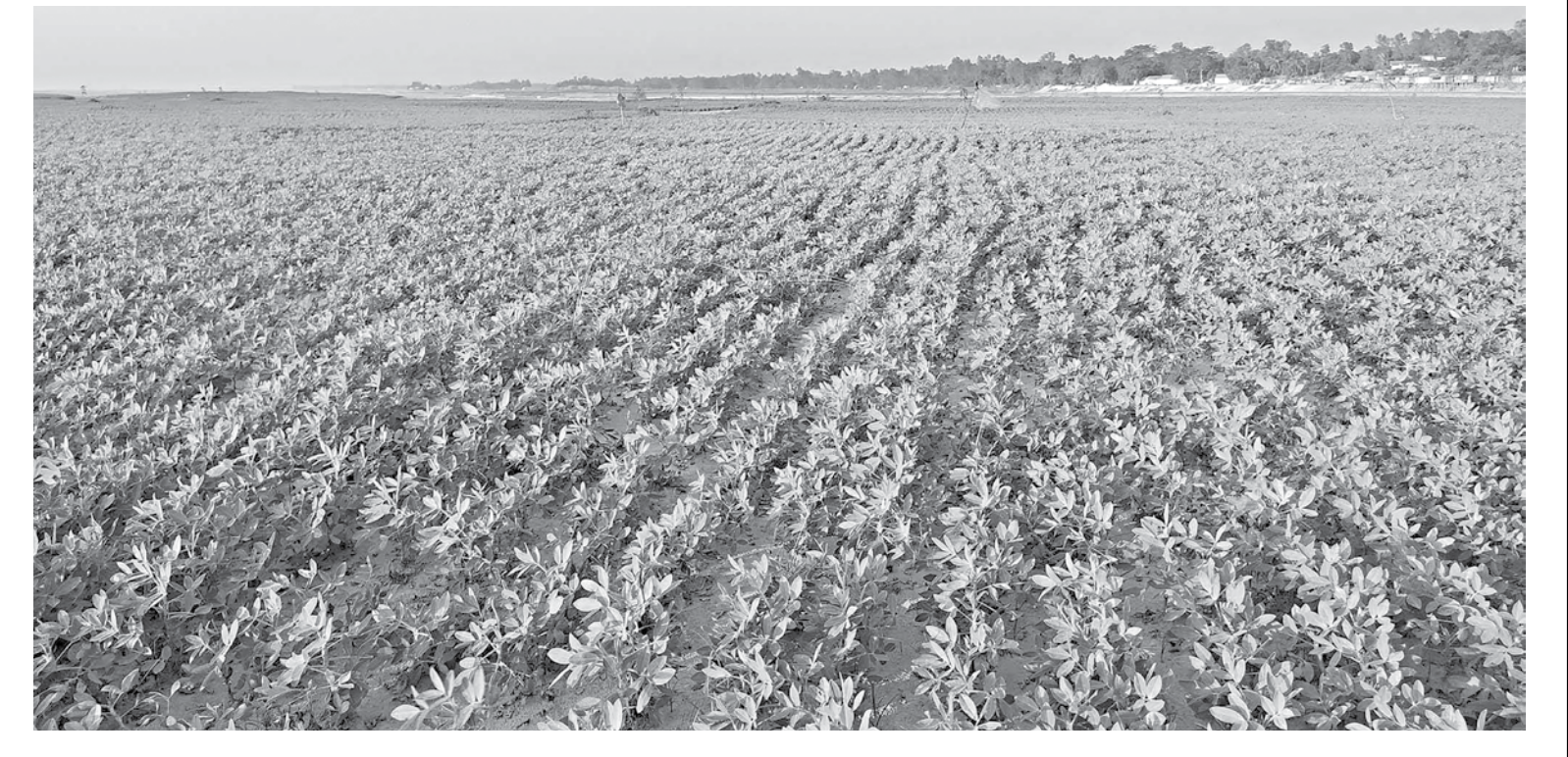
A peanut field of Jamuna river char at Boyra village in Tangail's Bhuapur upazila.