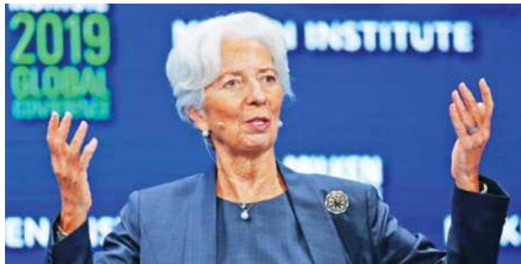
European Central Bank President Christine Lagarde

Analysts widely expect the ECB's governing council to add another 500 billion euros ($600 billion) to its 1.35-trillion-euro pandemic emergency bond-buying programme (PEPP), and extend it beyond the current