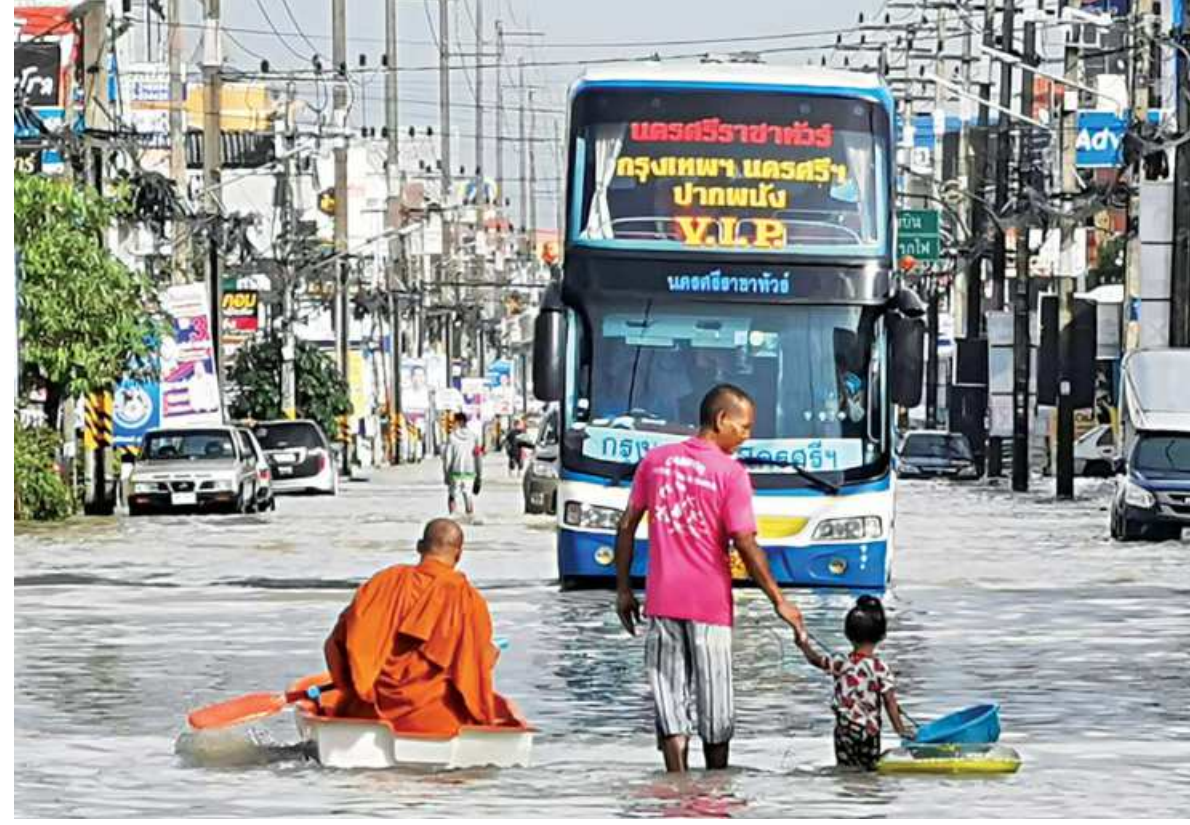
A Buddhist monk paddles a boat down a flooded street in Nakhon Si Thammarat province in Thailand yesterday. Six days of heavy rain caused widespread flooding in the province, affecting hundreds of communities and inundating large swaths of farmland.

attached to the ground and looked like it could be easily knocked over, the local media report stated. This is the third sighting of a monolith in less than 20 days after the first metal structure was spotted in Utah on 18 November, leading to speculations about why it was installed and by whom. Almost as mysteriously as it appeared, the structure was removed on 27 November by five men who told witnesses to "leave no trace".