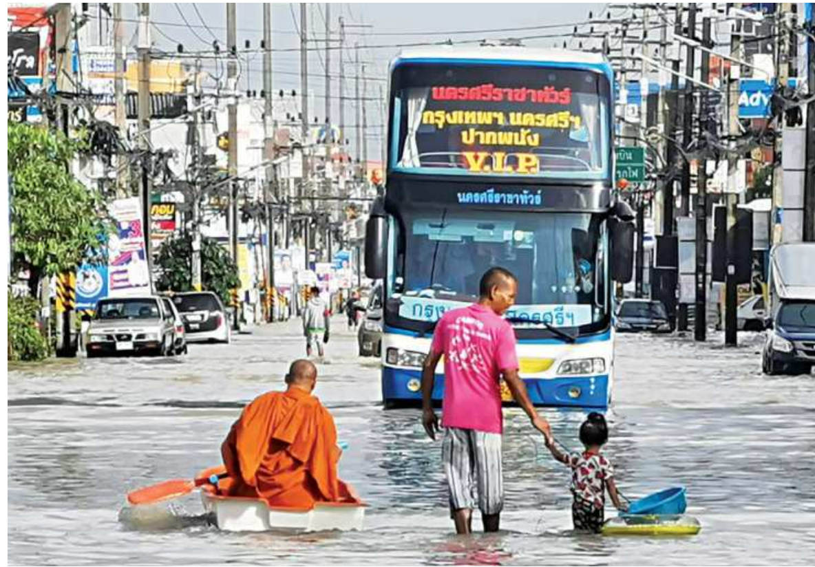
A Buddhist monk paddles a boat down a flooded street in Nakhon Si Thammarat province in Thailand yesterday. Six days of heavy rain caused widespread flooding in the province, affecting hundreds of communities and inundating large swaths of farmland.

"Seed crises provide a good lesson for the agriculture department. We have a plan to increase production of quality seeds to bring up the capacity of the department so that farmers are not harassed in this way in the future," the DG said.