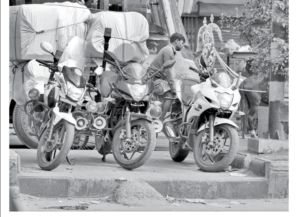
Three police motorbikes parked side by side on a footpath in front of Golap Shah's shrine at the capital's Gulistan yesterday, blocking the way for pedestrians. When law enforcers themselves flout rules, regular citizens find it increasingly normal to disregard law and order.

"A four-lane road from Begumganj to Laxmipur will be upgraded soon," he