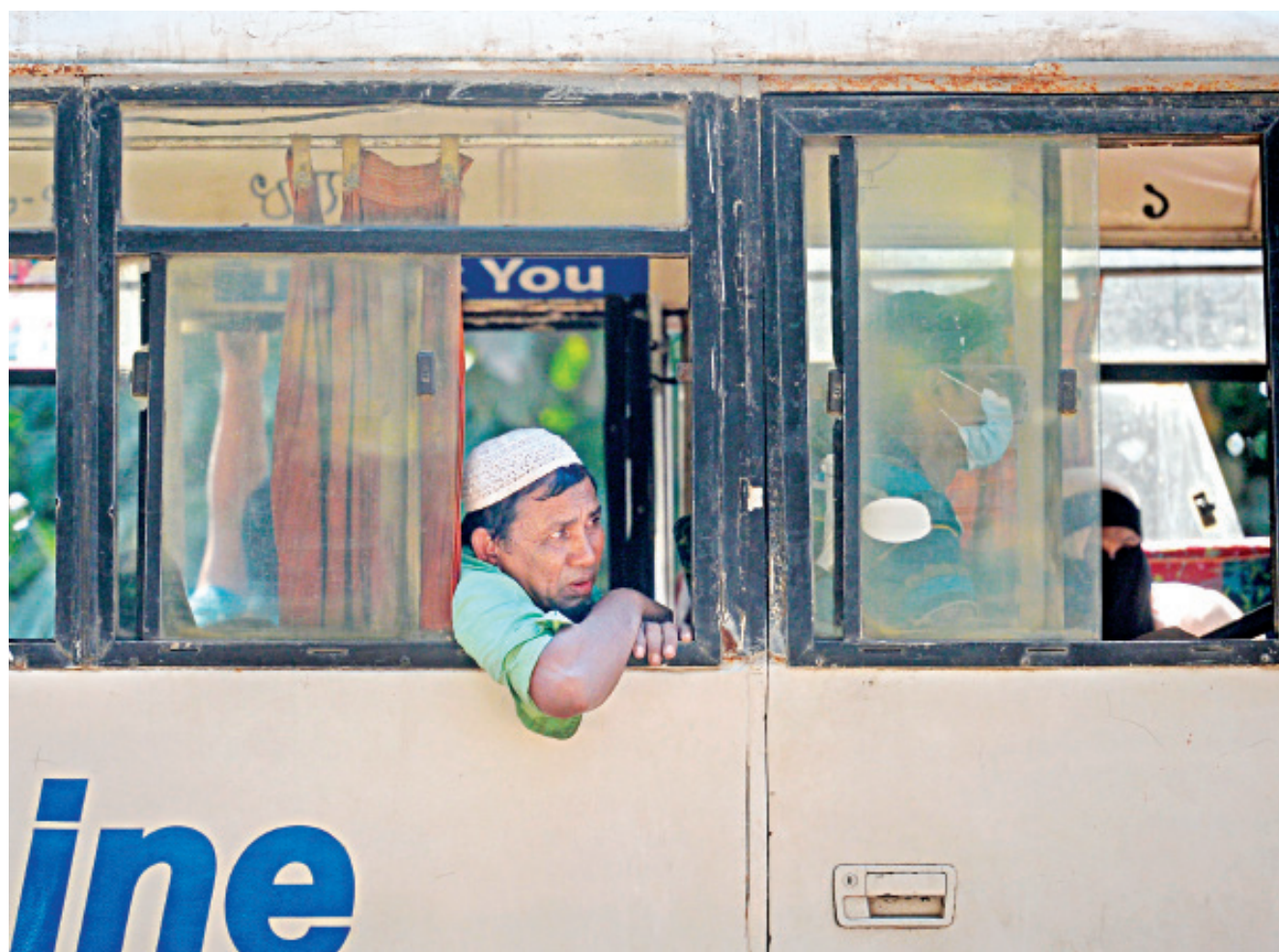
A Rohingya refugee looks ahead from a bus that is taking them to Bhasan Char from a refugee camp in Cox’s Bazar yesterday. Around 2,500 Rohingyas would be taken to the island in the Bay of Bengal from camps in Cox’s Bazar.