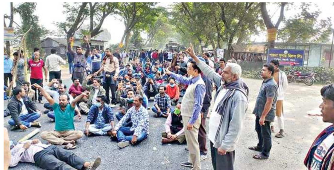
Workers and employees of Pabna Sugar Mill protest the decision of closure of the state-owned factory in front of the mill gate in Pabna yesterday.