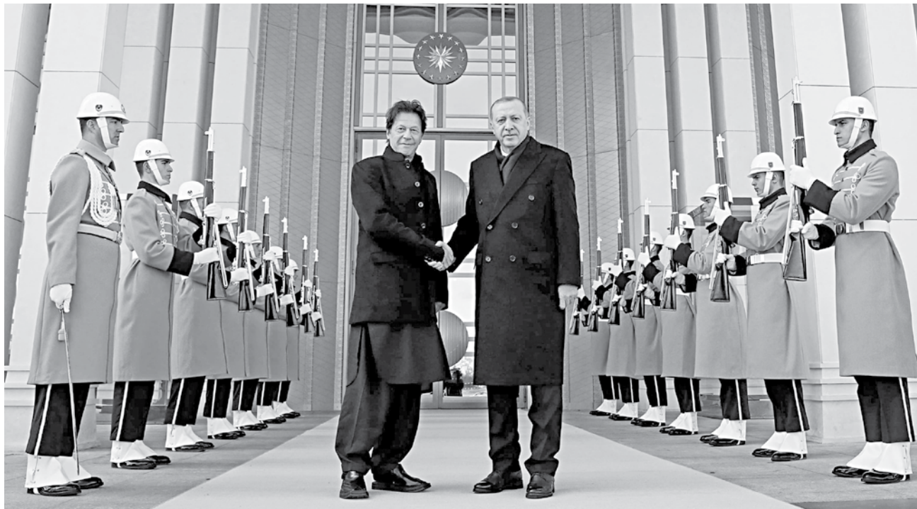
Pakistan's Prime Minister Imran Khan and Turkish President Recep Tayyip Erdogan.

The pressure on Pakistan is multi-fold. Pakistani Prime Minister Imran Khan charged recently that the United States and one other unidentified