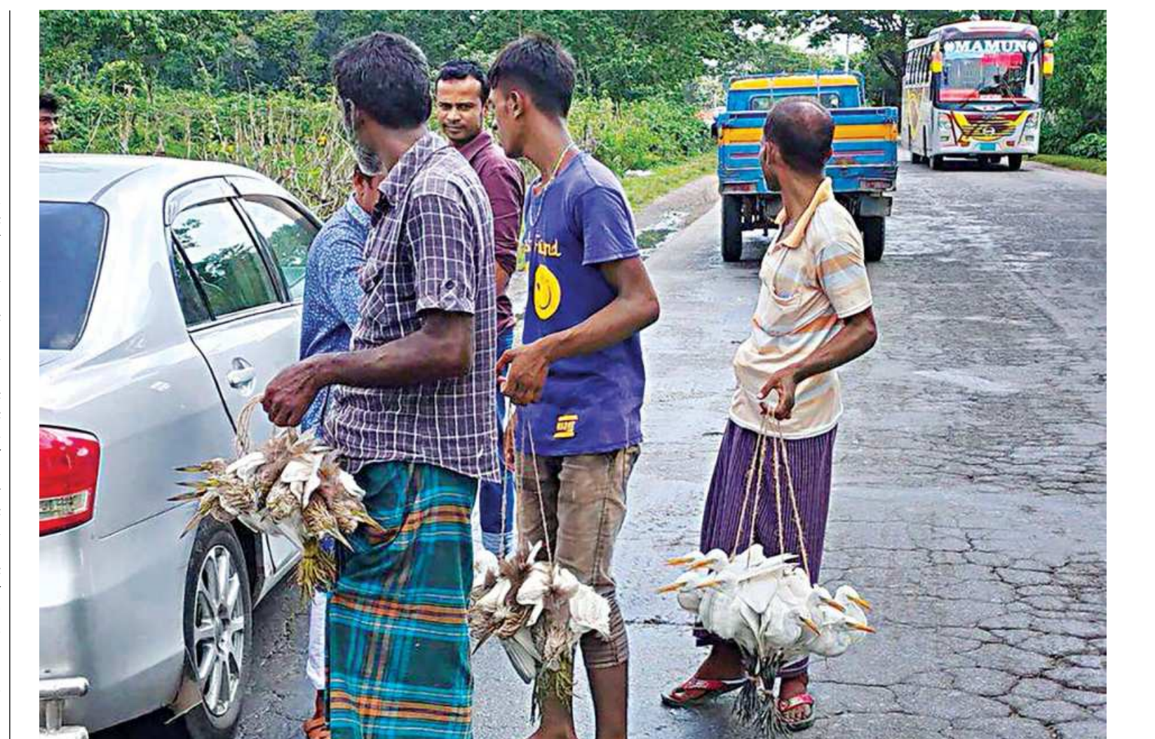
Illegal selling of birds is rampant on Dhaka-Sylhet highway in Debpara bazar area of Habiganj's Nabiganj upazila. Below, Rab in a drive seizes birds from poachers in the upazila.