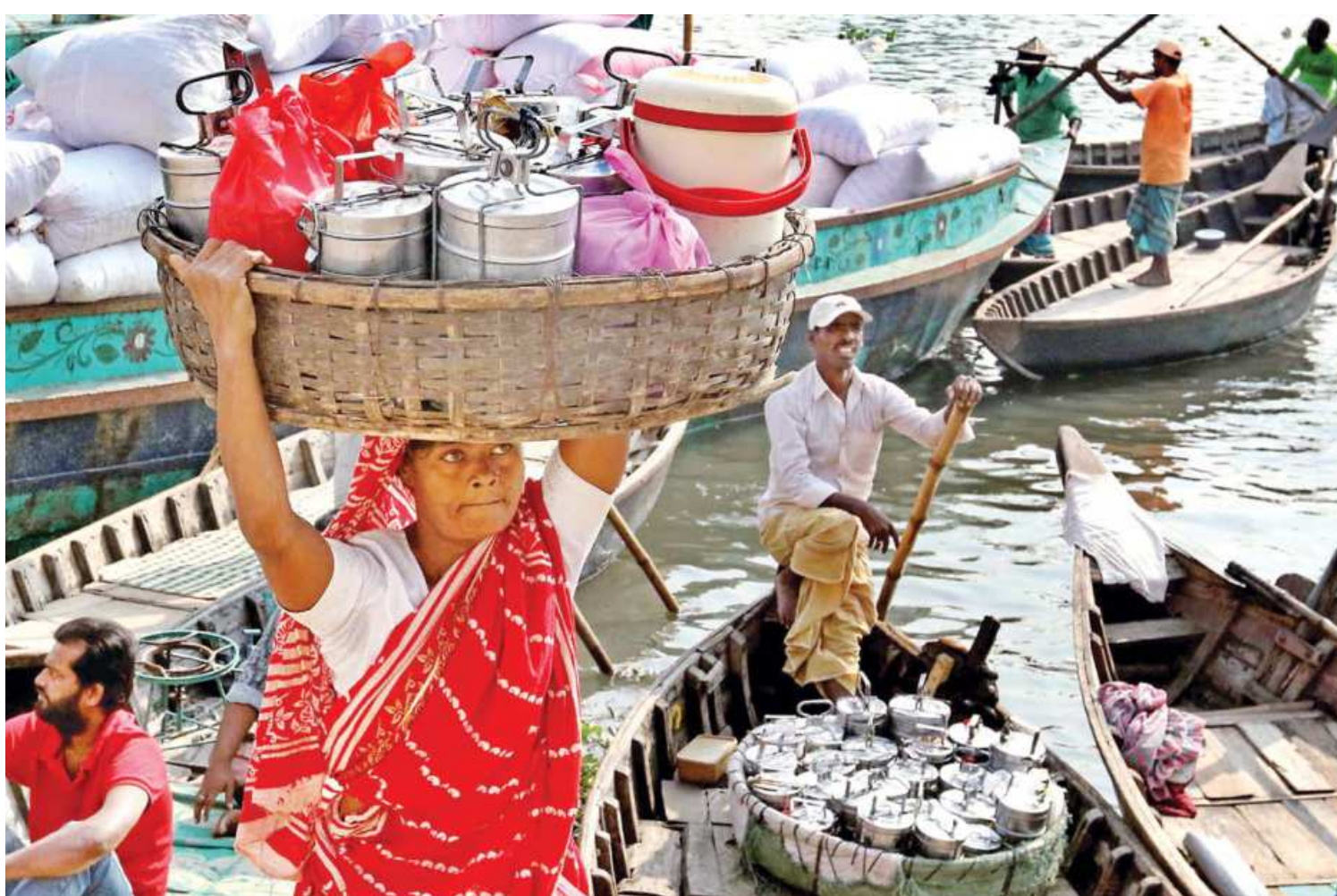
Carrying homemade food in a basket over her head, a woman walks off a boat in Shoari Ghat area of the capital. A group of such women in Kamrangirchar prepares lunch items, including rice, vegetables, fish and chicken, in their homes and sell them to shop owners and employees at different markets in Chowkbazar, Labagh and Shoari Ghat areas on the other side of the Buriganga river. They sell each meal for Tk 40 to Tk 50. The photo was taken yesterday.