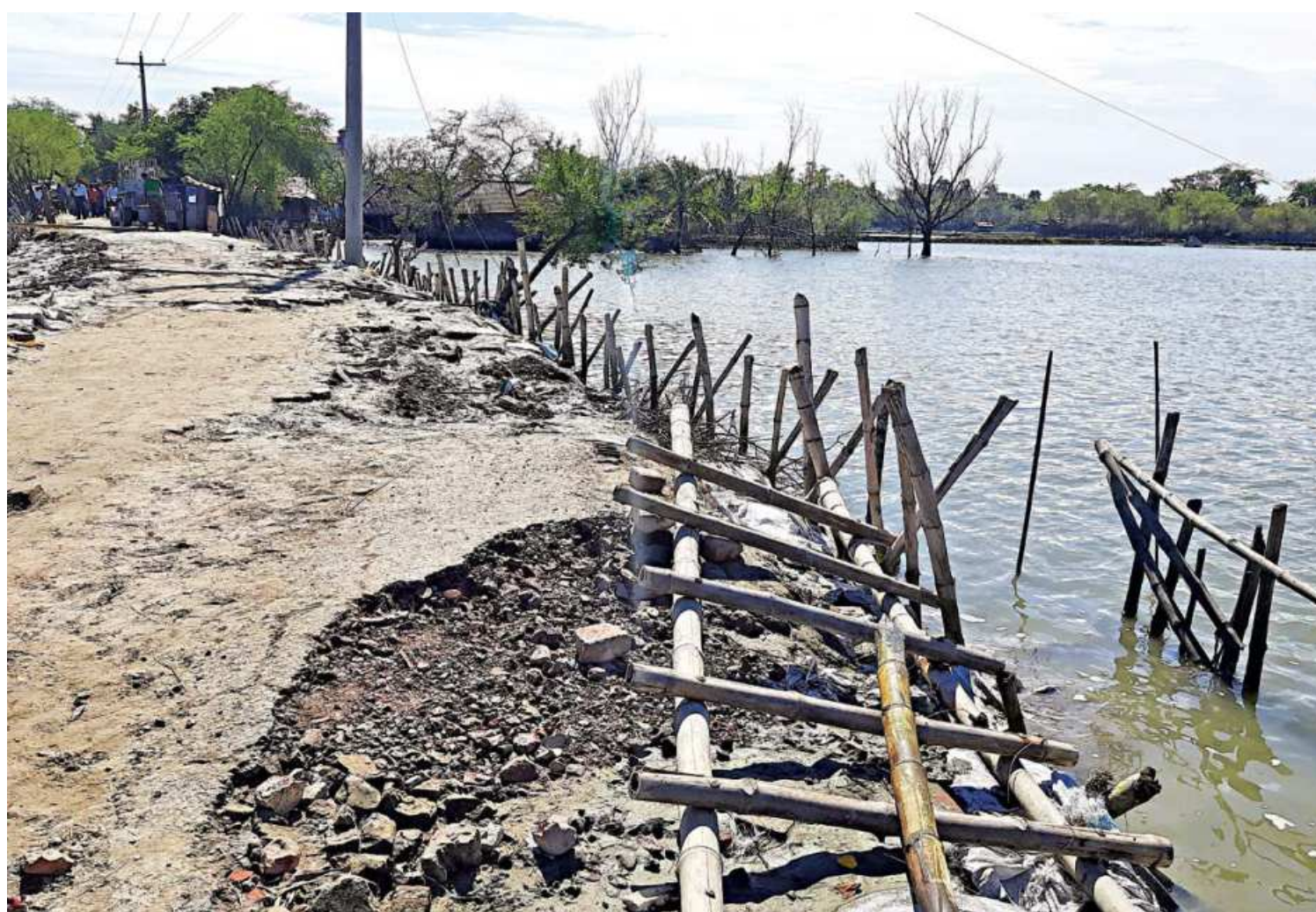
This road in Pratapnagar union of Satkhira's Assasuni upazila has been badly damaged for about six months since Cyclone Amphan hit the area in May, causing hardships for local people. A large area of the union is still submerged due to entry of water through some breaches in the Kopotakho and Kholpetua river embankments.