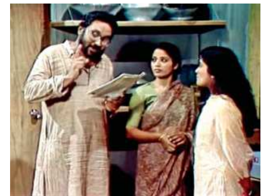
In the show 'Ekdin Hothath'.