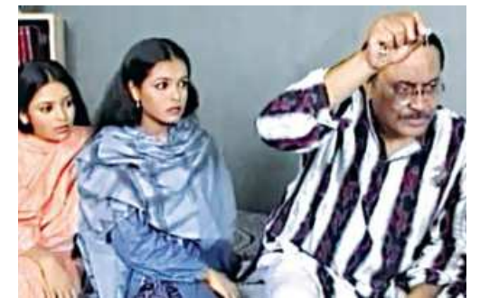
In 'Aj Robibar' as Boro Chacha.