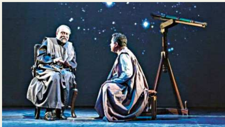
Aly Zaker in 'Galileo'.

Aly Zaker was one of the greatest actors to step foot on a stage in Bangladesh. Here is the thespian in some of his most memorable appearances in theatre.