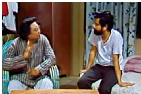
In 'Bohubrihi' with Asaduzzaman Noor.