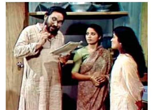
In the show 'Ekdin Hothath'.

Some other notable television projects of Aly Zaker include "Deyal", "Tothapi", "Ghoroawarir Shopno", "Goni Miar Pathor", "Nitu Tomake Bhalobashi", and "Pandulipi" among others.