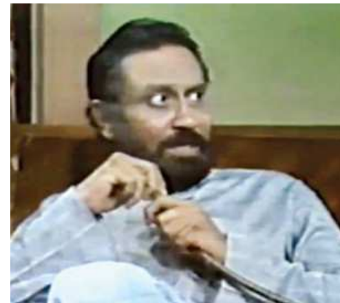
As the village chairman in 'Ochinbrikkho'.