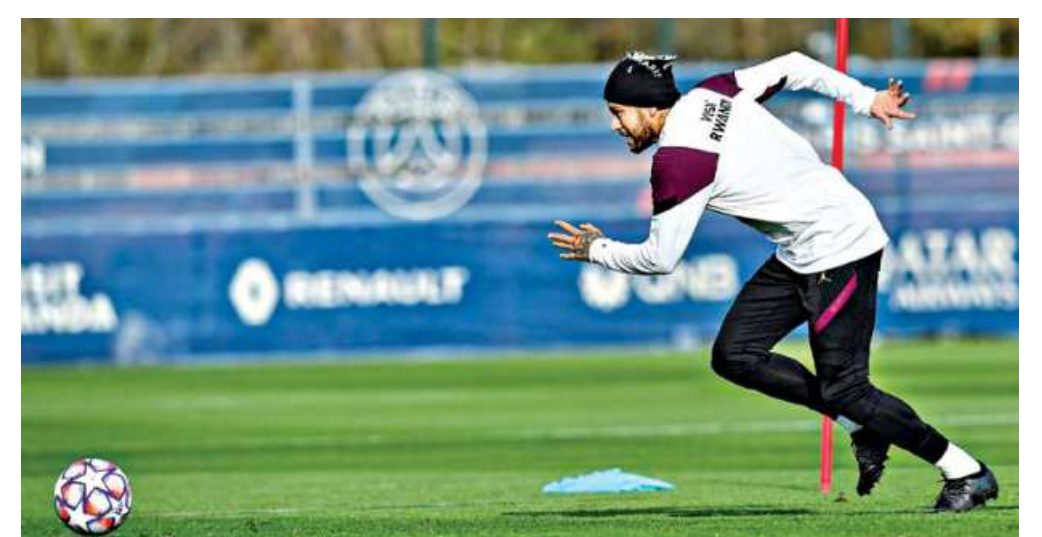
PSG forward Neymar will make his return to the Parisiens attack against Leipzig after being given a 30-minute run-out against Monaco as coach Thomas Tuchel has already confirmed one name on the PSG teamsheet for the Champions League showdown.

Ronald Koeman's men sit top of their group with a perfect record after the opening three games and will all but guarantee their qualification to the knockout stages with a repeat victory