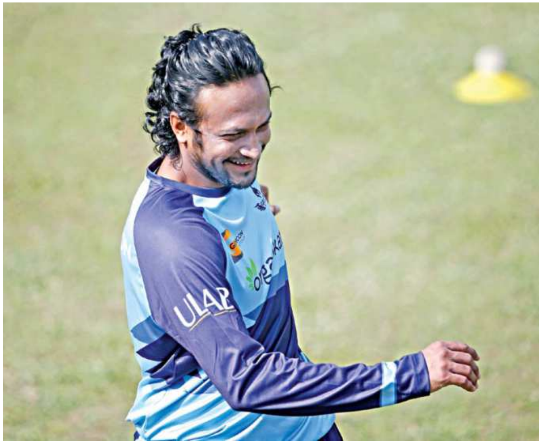
The major attraction of the opening day of the Bangabandhu T20 Cup will be Shakib Al Hasan as the premier all-rounder is all set to make a return to competitive cricket for the first time since his ban. Meanwhile, the opposing captains for the day -- Tamim Iqbal of Fortune Barishal and Mahmudullah Riyad of Gemcon Khulna; Mushfiqur Rahim of Beximco Dhaka and Nazmul Hossain Shanto of Minister Group Rajshahi -- were all smiles as they posed for pictures during practice yesterday.

UEFA Champions League Krasnodar v Sevilla Live from 11:55pm Man United v Istanbul Basaksehir Live from 2:00am (Wednesday)