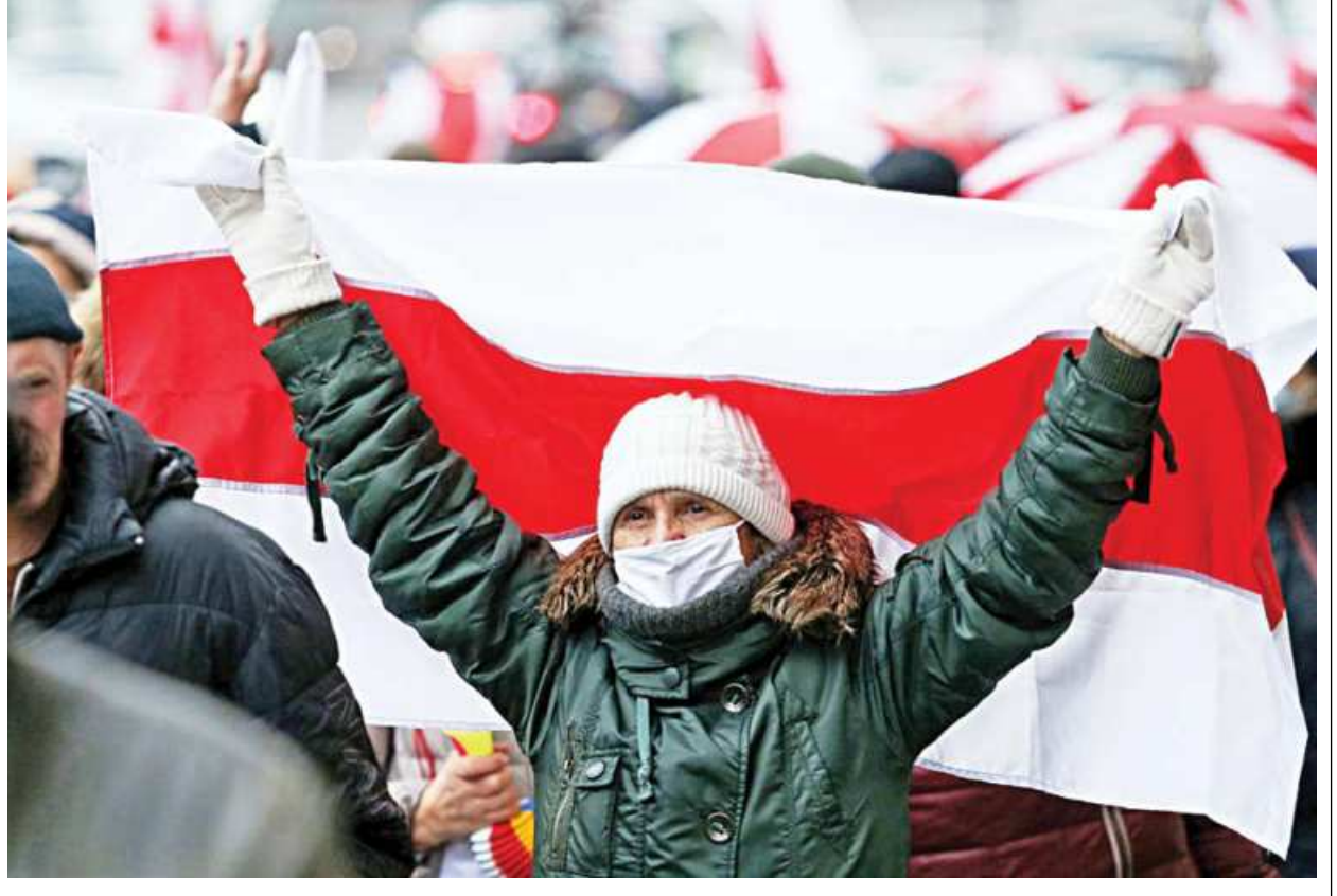
An elderly woman carries a former white-red-white flag of Belarus as Belarusian pensioners parade through the streets during a rally to protest against police violence in Minsk, yesterday. For more than three months Belarus has been gripped by historic protests after a disputed presidential vote that saw strongman leader Alexander Lukashenko re-elected for a sixth term.

effectiveness in trials. The European Union said it could approve vaccines for use by the end of the year, following a statement from US officials that a vaccination programme could be started as soon as next month.