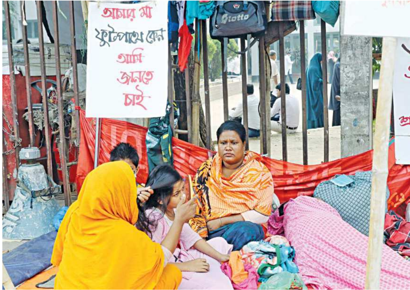
The family members of the victims of Tazreen Fashions fire incident are seen in a sit-in protest in front of Dhaka Press Club in the capital on last Friday.