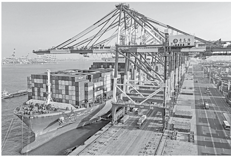
A cargo ship loaded with containers berths at a port in Qingdao in China's eastern Shandong province.

But according to economist Rehman Sobhan, when talking about Chinese investment, "we shouldn't just talk about [infrastructure] investment as most of it are coming in the form of aid or for specific projects and those investments are ad-hoc in