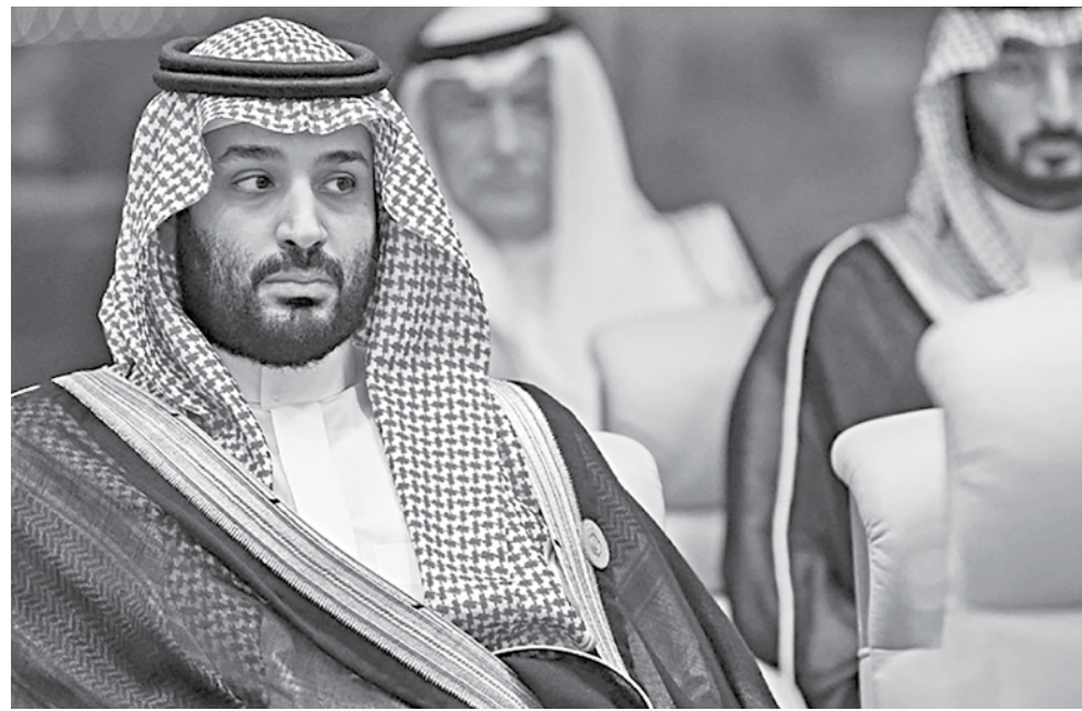
The G20 summit will be virtual, depriving this year's host, Saudi Arabia, of a prime platform for projecting an orchestrated image.

Former Saudi intelligence chief and ambassador to London and Washington Prince Turki Al Faisal suggested that the absence of human rights in the kingdom's efforts was no coincidence.