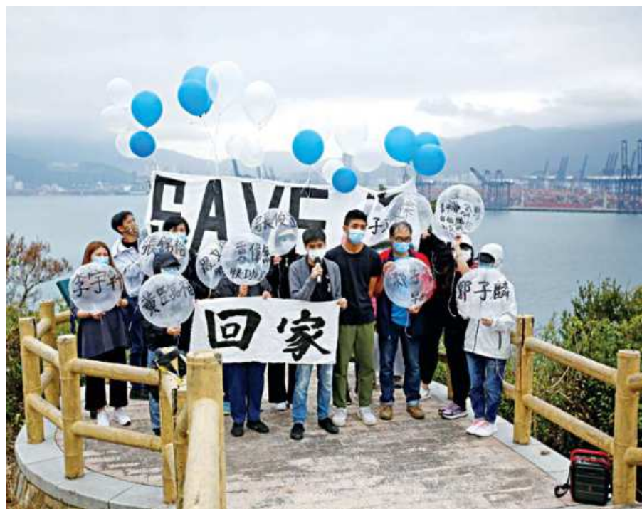
Relatives and supporters of the 12 Hong Kong people detained in mainland China release balloons from a peak overlooking Yantian district in the neighbouring Chinese mainland city of Shenzhen, at a protest in Hong Kong, yesterday.

"Without strong action to ensure appropriate use of existing antibiotics, as well as new and better treatments, that figure could rise to 10 million by 2050."