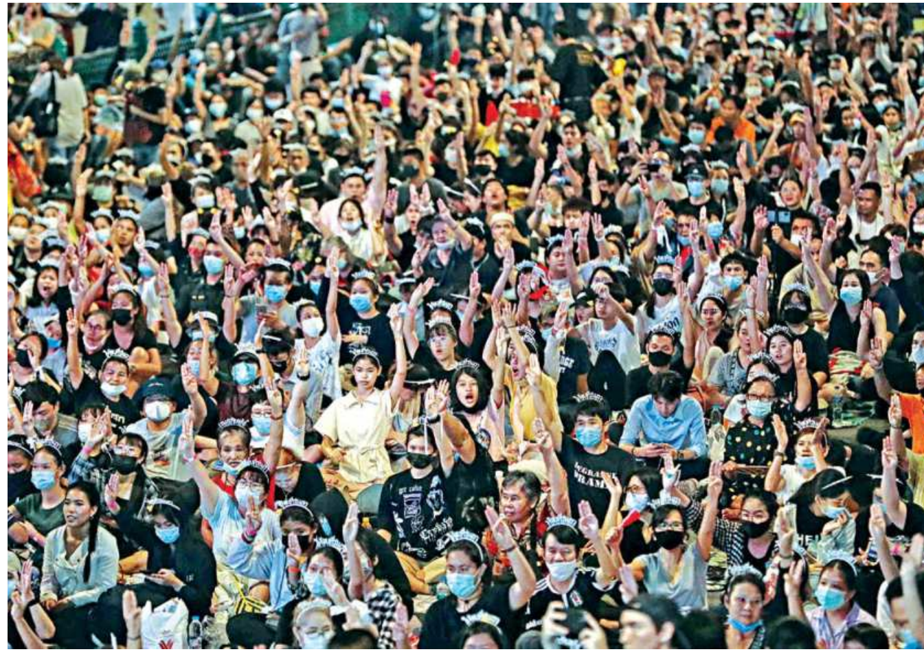
Pro-democracy protesters hold up the three-finger salute during a 'Bad Student' rally in Bangkok, yesterday. High school students led a protest by thousands of people in Bangkok yesterday with calls to bring down the government and reform the monarchy. It was the first major protest since Prime Minister Prayuth Chan-ocha said on Thursday that police would use all laws against protesters, who have become the biggest challenge to Thailand's rulers in years.

Officials told AFP on Friday however that a breakthrough was expected to be announced in the coming days, and the US State Department announced late Friday that Secretary of State Mike Pompeo would meet negotiators from the Taliban and the Afghan government in Doha.