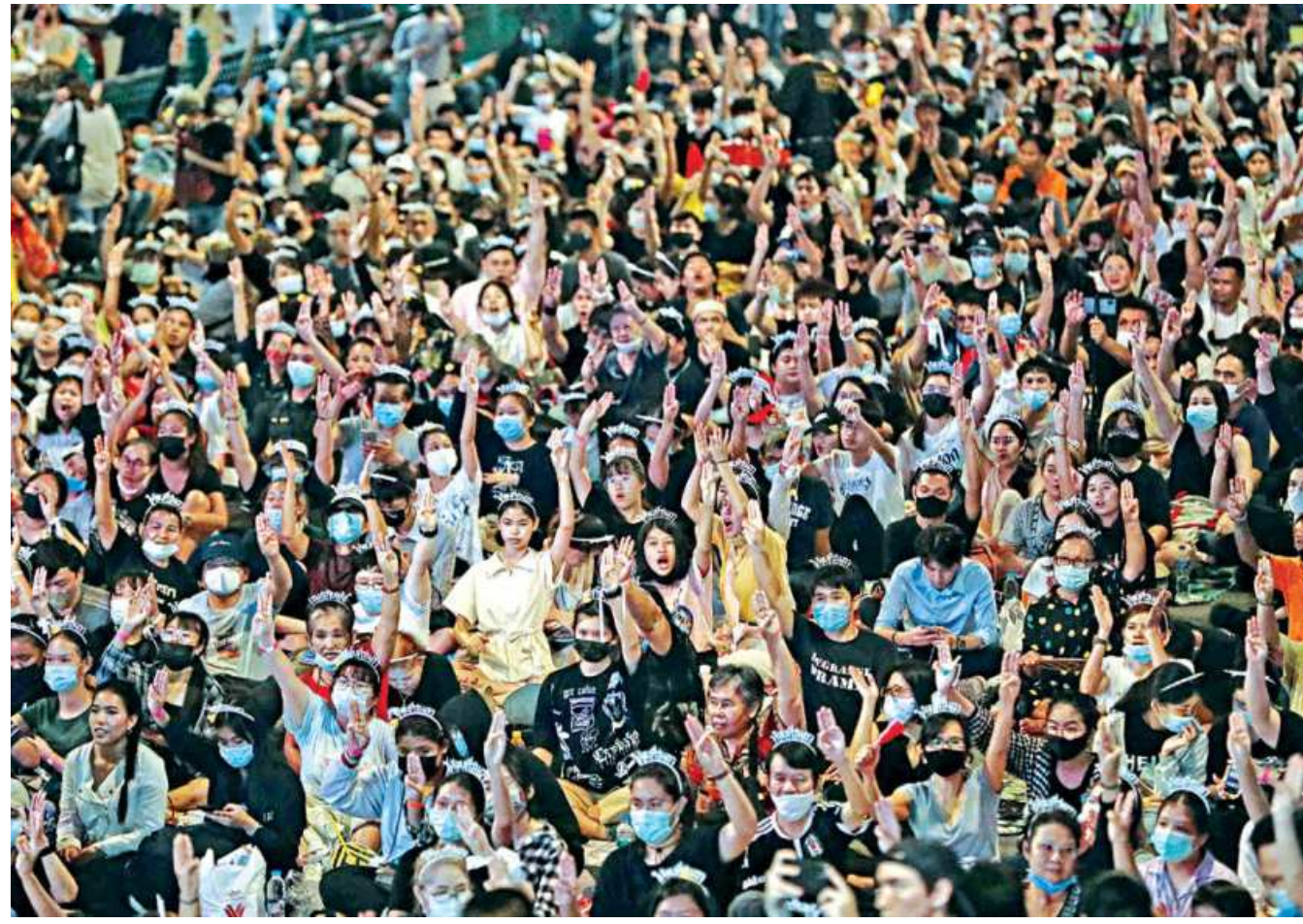
Pro-democracy protesters hold up the three-finger salute during a 'Bad Student' rally in Bangkok, yesterday. High school students led a protest by thousands of people in Bangkok yesterday with calls to bring down the government and reform the monarchy. It was the first major protest since Prime Minister Prayuth Chan-ocha said on Thursday that police would use all laws against protesters, who have become the biggest challenge to Thailand's rulers in years.

Officials told AFP on Friday however that a breakthrough was expected to be announced in the coming days, and the US State Department announced late Friday that Secretary of State Mike Pompeo would meet negotiators from the Taliban and the Afghan government in Doha.