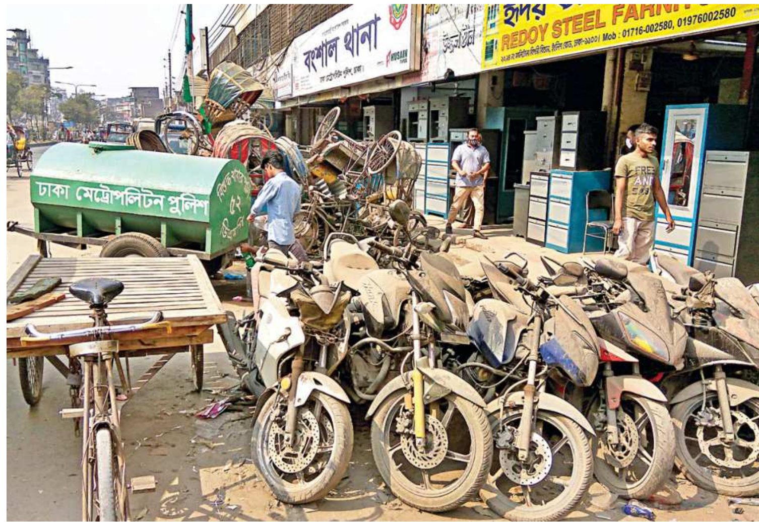
Motorcycles and rickshaws gathering dust in front of Bangshal Police Station in the capital. Seized at different times, generally due to not having valid documents, these vehicles take up a substantial amount of the road in front of the police station. This photo was taken on Thursday.

JAMIL MAHMUD Probashi Kalyan Bank, a specialised financial institution for migrant workers, is struggling to conduct its day-to-day activities due to manpower shortage. The bank has 64 branch offices all over the country, including a principal branch located at the Probashi Kalyan Bhaban in the capital. It also has a booth at the Hazrat Shahjalal International Airport. But it currently has only about 210 officials, apart from some drivers and office assistants, said a top official of the bank, on condition of anonymity. As a result, they are facing difficulties, especially at field level, as they need to do field-level inspections before disbursing every loan, irrespective of amount. "It is tough to cover the whole country with the bank's existing manpower," the official added. Bank sources said it submitted to the authorities concerned a proposal for eight additional personnel, including officials and other employees, for each branch, which is at the final stage of approval. The bank's work rate will increase significantly once it gets the required manpower, the top official said. In addition to its regular activities, Probashi Kalyan Bank has recently been tasked with disbursing the "special reintegration loan" from a Tk 200-crore fund created for returnee migrant workers economically affected by the coronavirus pandemic.