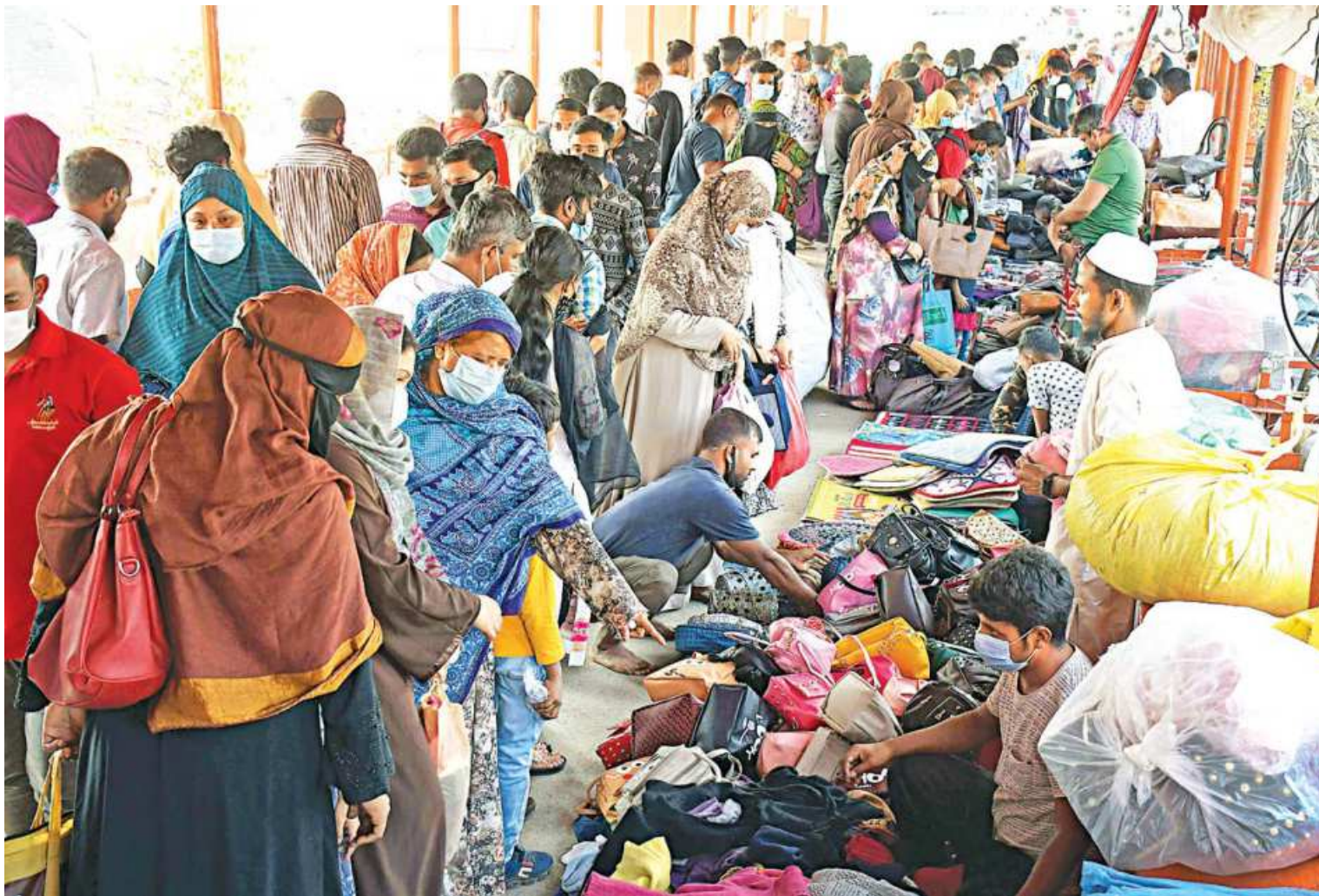
The authorities have ordered social distancing and other restrictions ahead of winter to avert a possible second wave of the coronavirus outbreak. But the rules remain on paper while people buy goods from vendors on this footbridge near New Market in the capital. Thankfully though, most of them have some kind of face coverings.