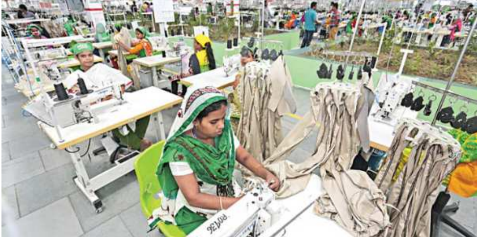
Women are seen working in a green factory of Remi Holdings inside Adamjee Export Processing Zone in Narayanganj.