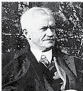
ALBERT JAY NOCK (1870-1945) American author.

The mind is like the stomach. It is not how much you put into it that counts, but how much it digests