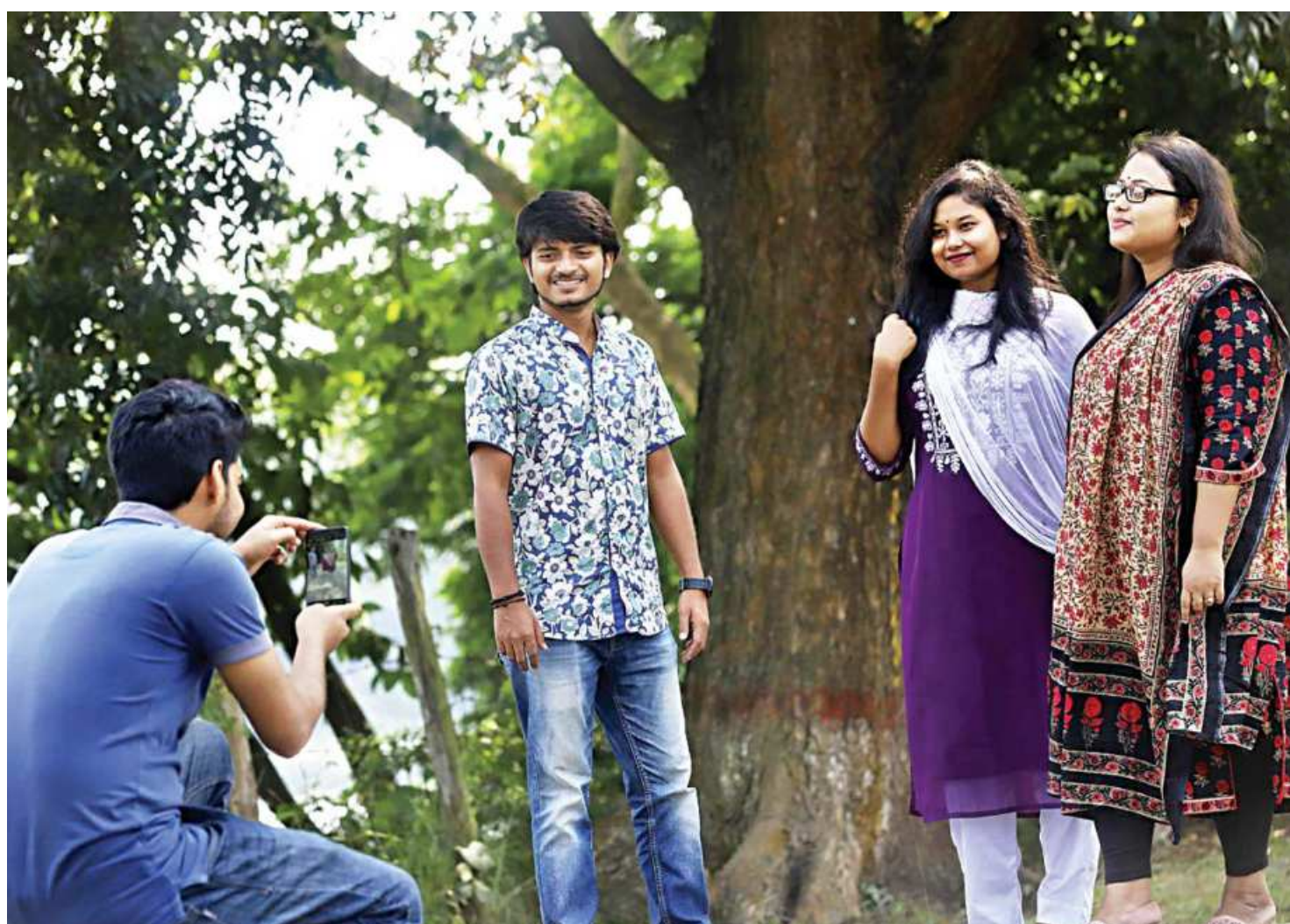
In-person classes are still on hold in universities across the country. These four classmates visited their campus at Jahangirnagar University after a long nine months, and did a quick photoshoot to mark the small reunion.