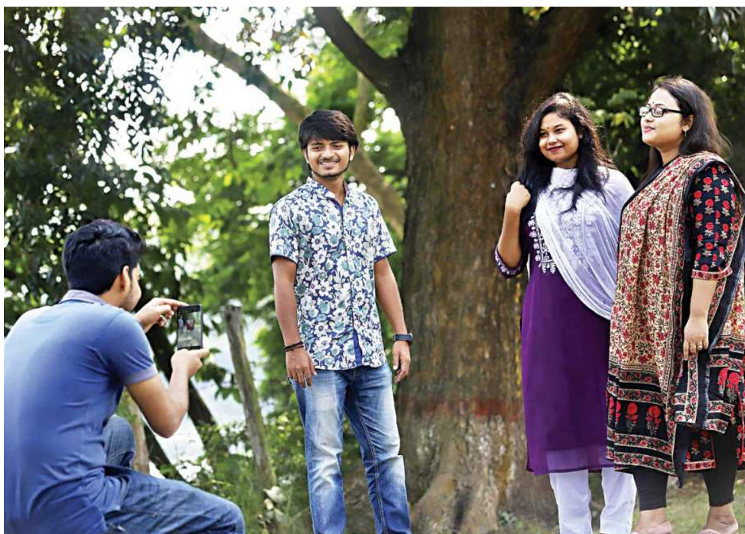
In-person classes are still on hold in universities across the country. These four classmates visited their campus at Jahangirnagar University after a long nine months, and did a quick photoshoot to mark the small reunion.