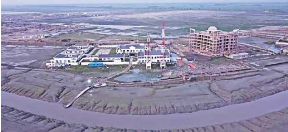
The bird's-eye view of Bangabandhu Sheikh Mujib Shilpa Nagar in Chattogram.