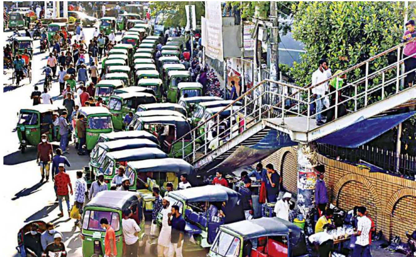
Auto rickshaws are triple parked and the pavement is occupied by hawkers selling mostly shoes at the bottom of a staircase for a footbridge in Court Point area of Sylhet city yesterday. This makes it very difficult for pedestrians to access the bridge. The situation is almost identical at the other staircases of the bridge.