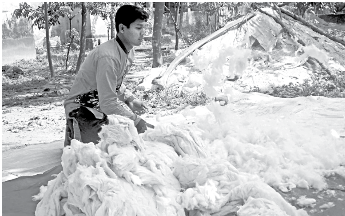
A worker passing busy time making quilt at a shop in Dinajpur's Phulbari upazila. The demand of the item sees rise with the arrival of winter in the northern region of the country.