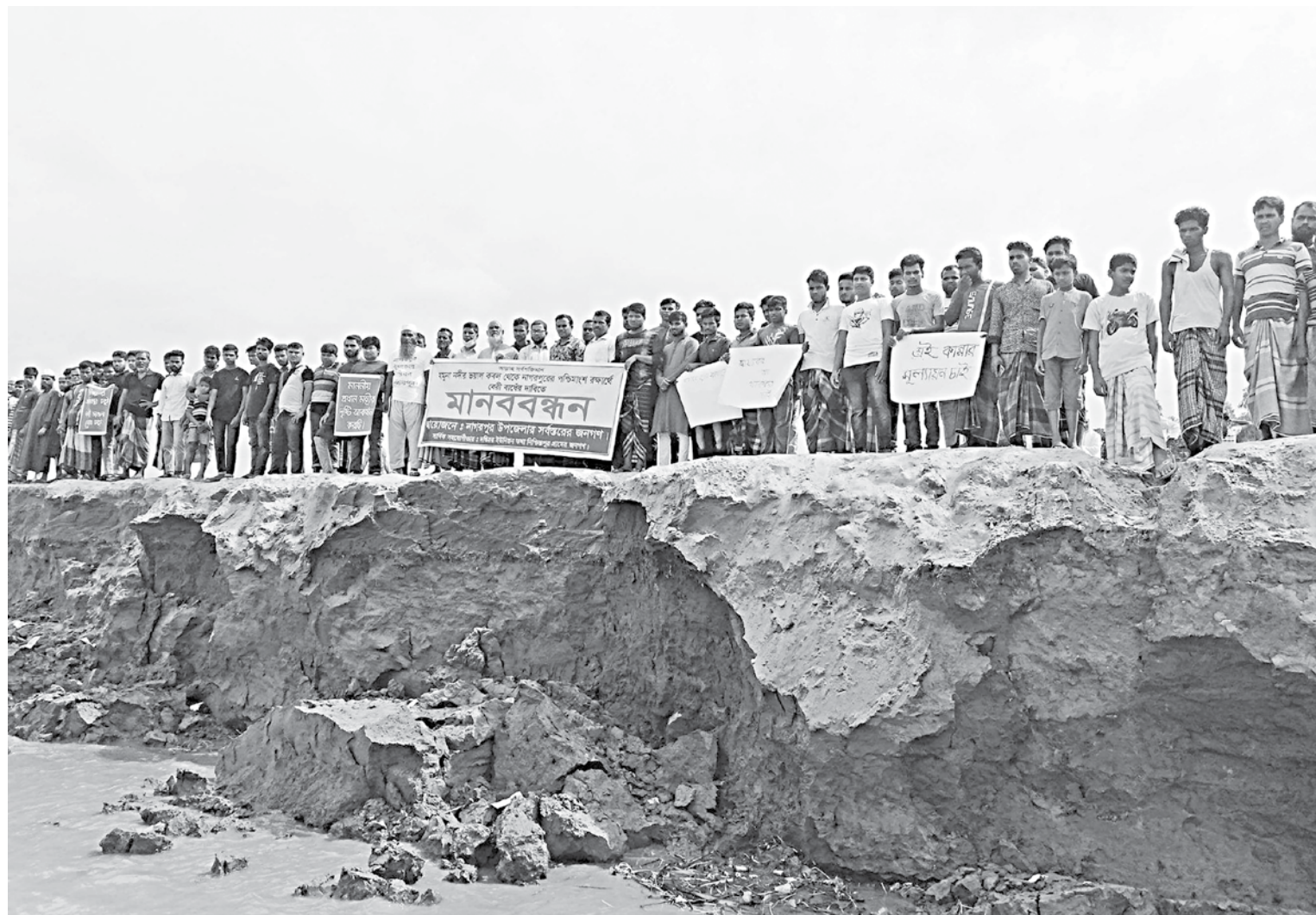
Local people in Solimabad and Doptior unions of Tangail's Nagarpur upazila formed a human chain beside the Jamuna river in Nishcintapur area last week, demanding to construct an embankment in the area to save the localities from erosion.

They have already made a project to save the unions from erosion and sent it to the ministry concerned for approval, said the engineer.