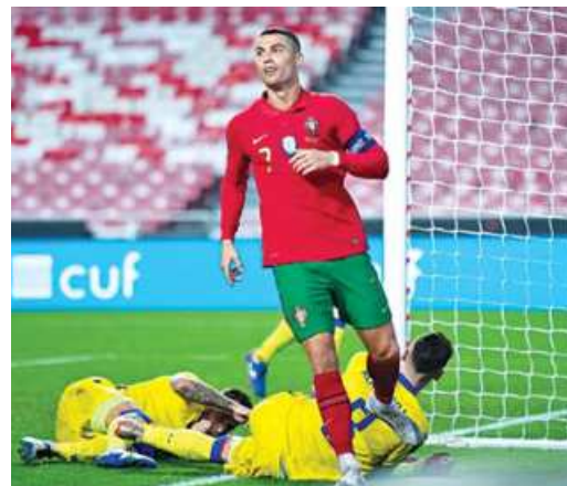
Cristiano Ronaldo got his 102nd goal for his country as Portugal thrashed Andorra 7-0 while Croatia captain Domagoj Vida was taken off at half-time against Turkey as a number of friendly matches took place across Europe on Wednesday night. Meanwhile, (bottom) Sergio Ramos made a cameo appearance, equalling Gianluigi Buffon's record of 176 international caps for an European player, during Spain's 1-1 draw against the Netherlands.