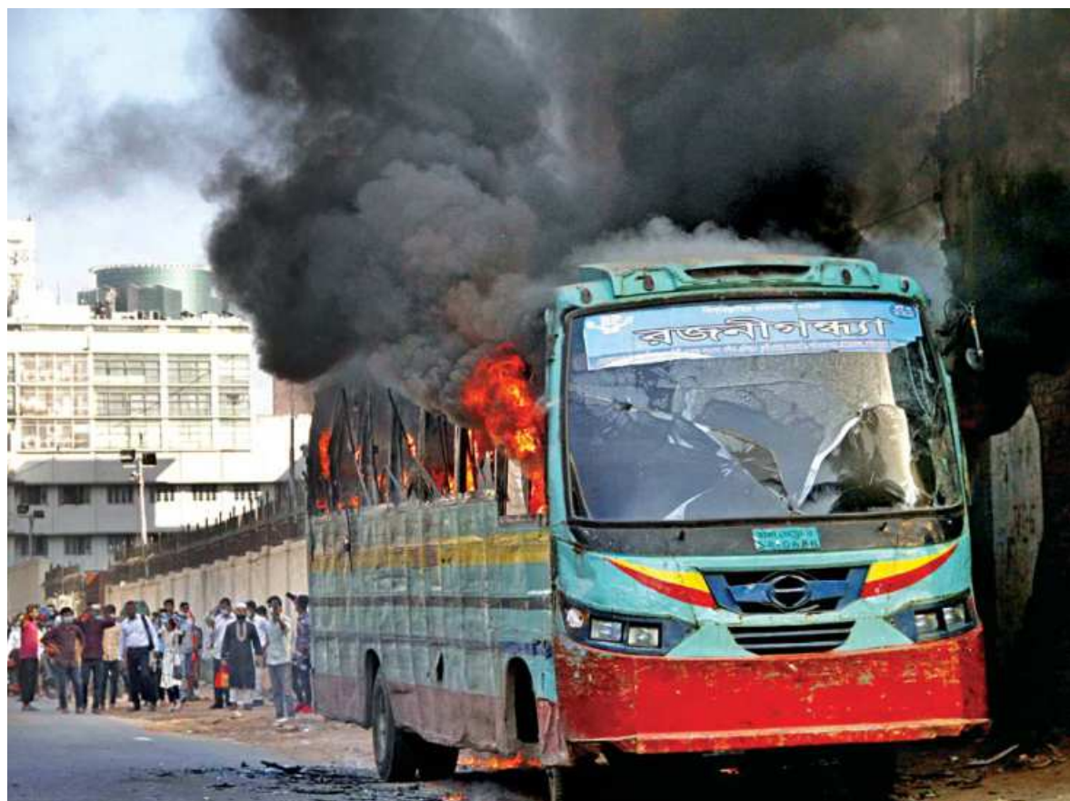
A bus is burning near Bangladesh Secretariat. Nine such buses were set ablaze at different parts of the city within a span of few hours yesterday. Police say the torching was part of a plan to destabilise law and order.