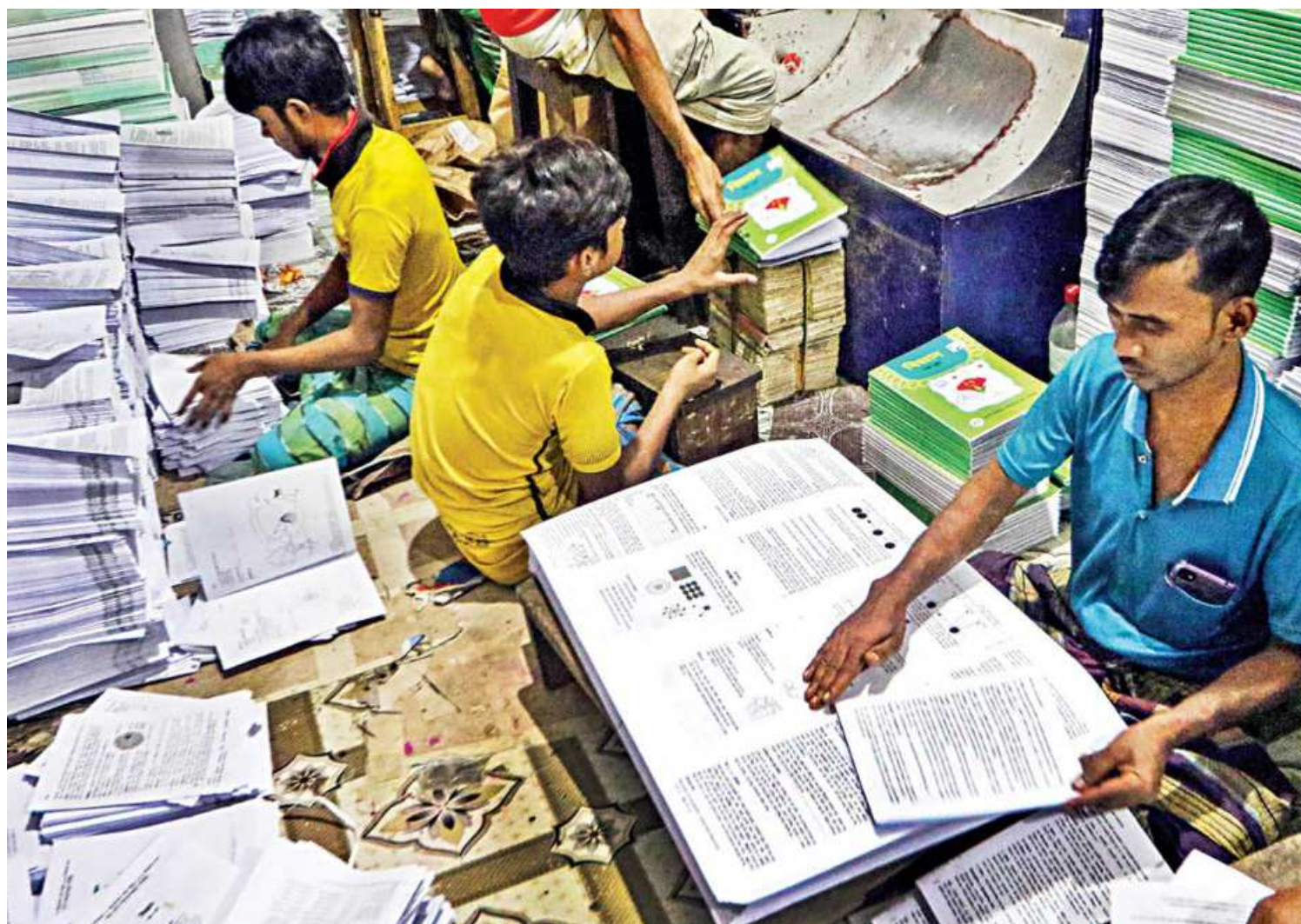
Workers at a publishing house are busy binding textbooks for school students who are to begin the new year's session. The photo was taken at the capital's Sutrapur area yesterday.