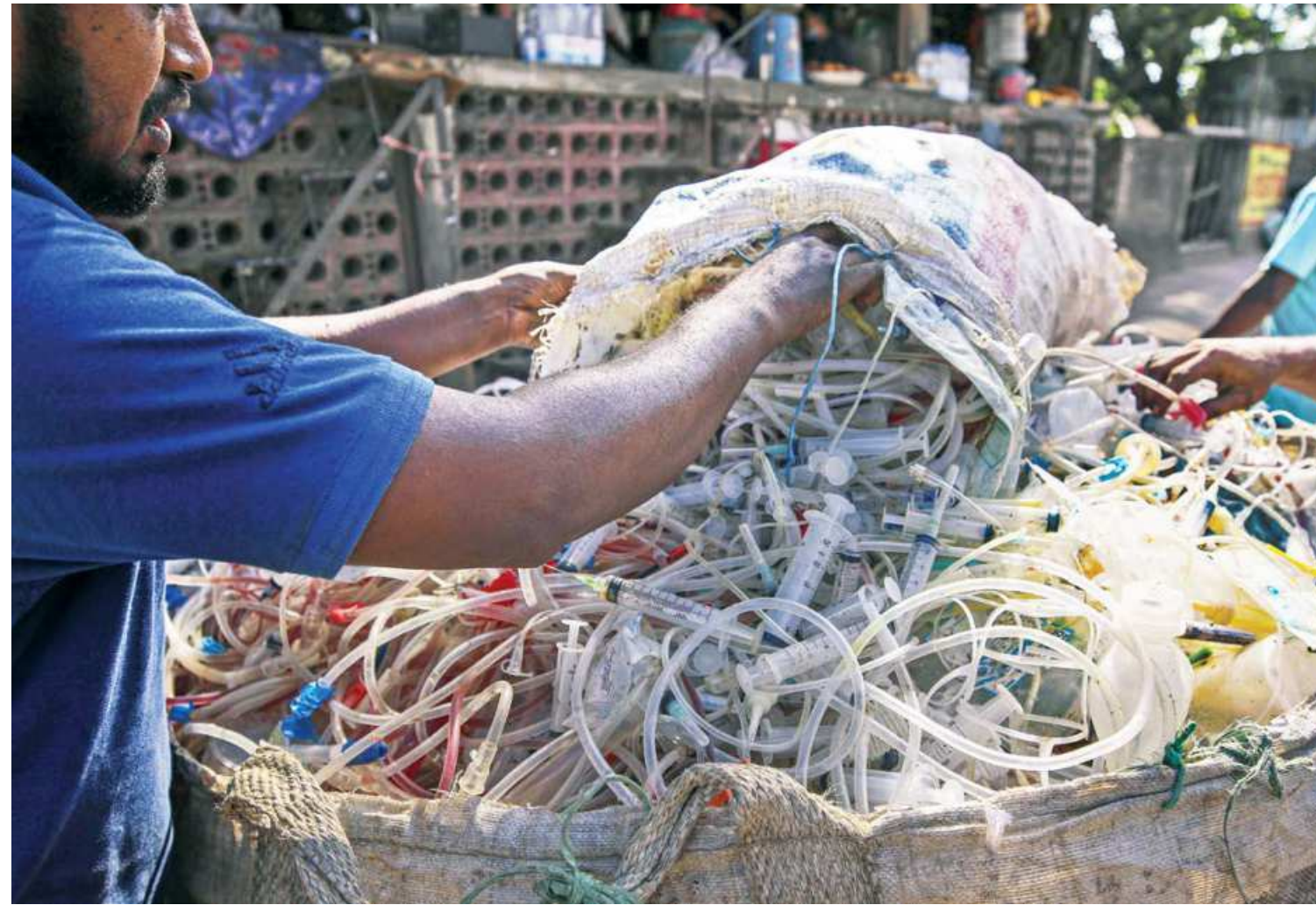
A trader sorting through medical waste out in the open after collecting them from different hospitals and clinics in Chattogram city's Gol Pahar area. Most of the hospitals do not bother to comply with the regulations for proper waste disposal, risking the spread of various deadly diseases.