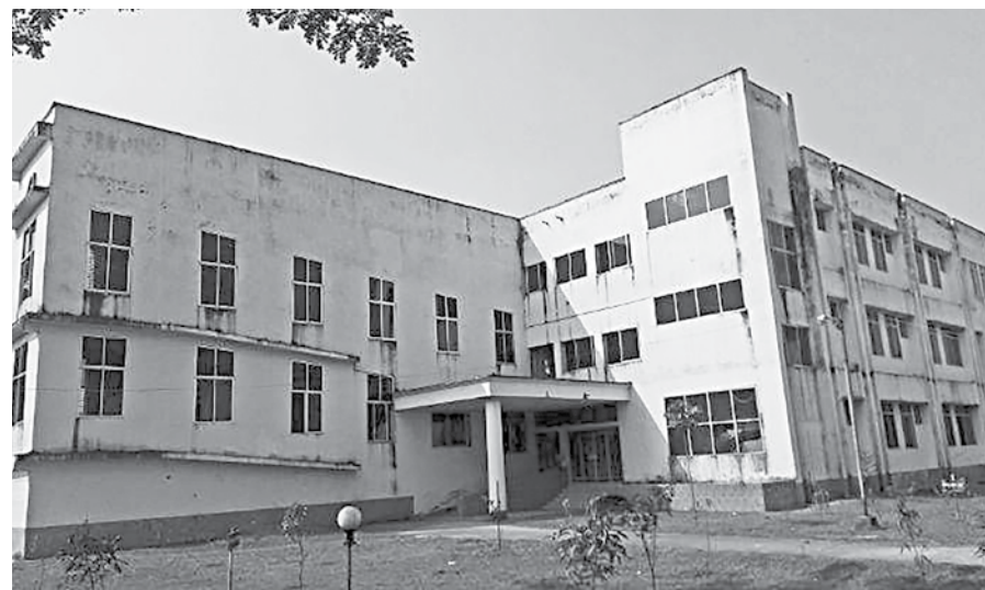
The three-storied trauma centre building in Habiganj's Bahubal upazila lies unused for six years.