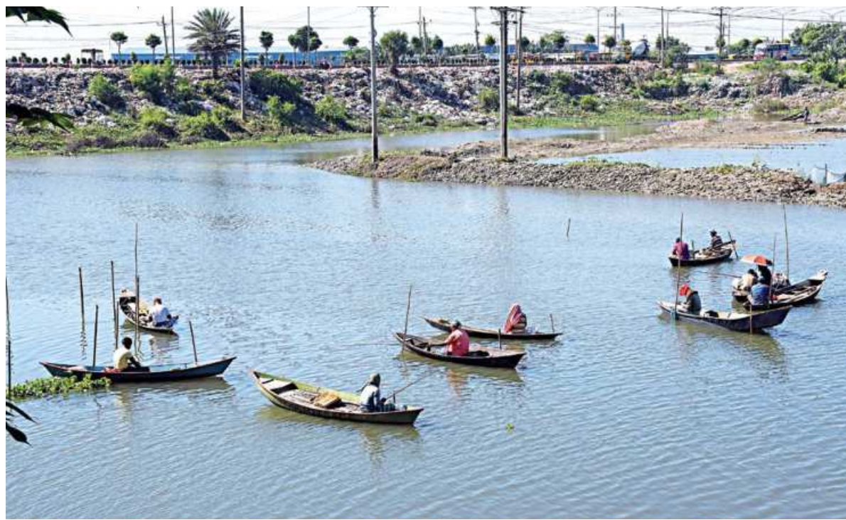
Villagers catching fish yesterday morning as the flood water began to recede from the low-lying Baliapur area in Aminbazar, Savar.

He also said question papers would be prepared in such a way that a textbook-centric study habit grows among students.