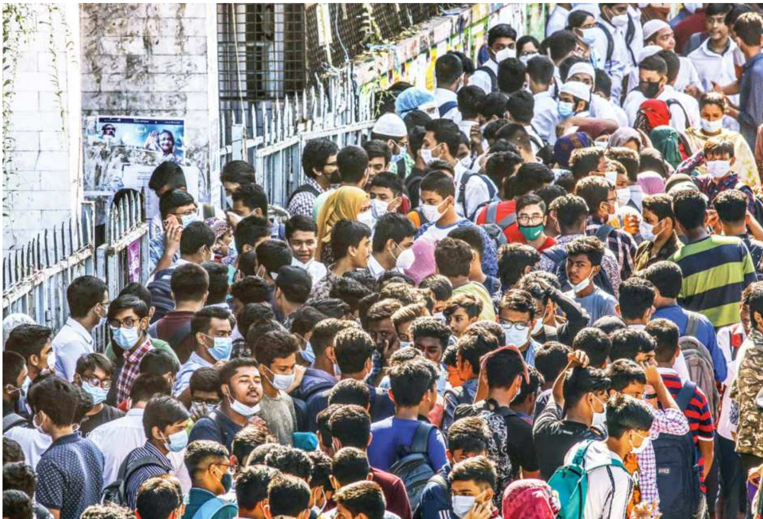
The crowd could not have been denser in front of Ideal School and College in the capital's Motijheel yesterday when students of grades VI-IX and their parents went there to hand in their assignment papers to the school authorities. This happened at a time when the prime minister urged the nation to follow the coronavirus rules to stay safe during winter.