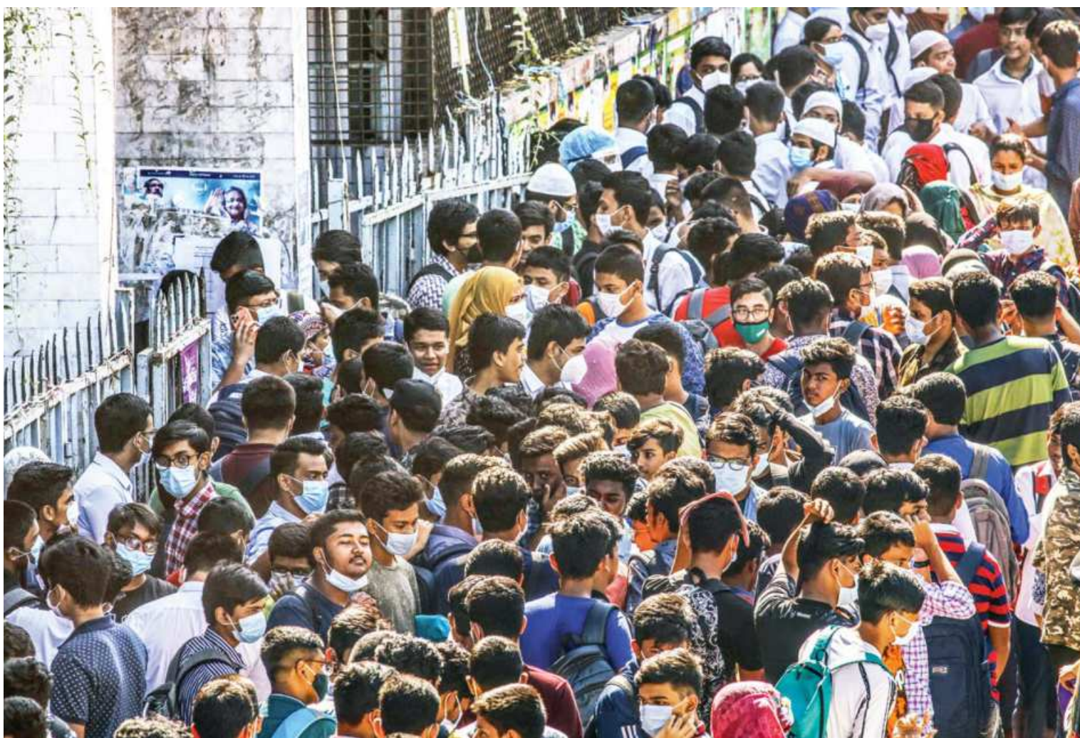
The crowd could not have been denser in front of Ideal School and College in the capital's Motijheel yesterday when students of grades VI-IX and their parents went there to hand in their assignment papers to the school authorities. This happened at a time when the prime minister urged the nation to follow the coronavirus rules to stay safe during winter.