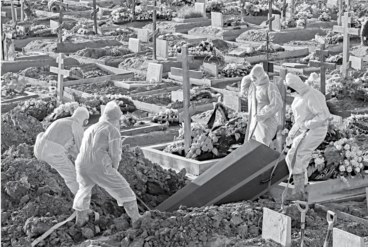
Grave diggers wearing personal protective equipment (PPE) lower a coffin while burying a person in the special purpose section of a graveyard for the coronavirus disease (Covid-19) victims on the outskirts of Saint Petersburg, Russia, yesterday.