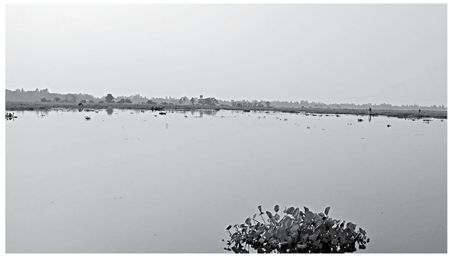
Sonai Beel in Santhia upazila of Pabna.