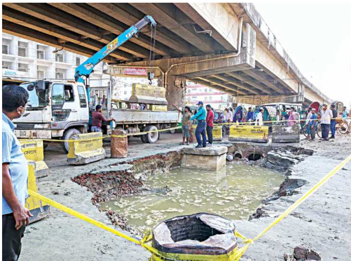
A large gaping hole formed on this road at Chattogram city's Bahaddarhat area yesterday, after a pipeline of water cracked, releasing a huge amount of water underneath the road. The surface eventually gave in to the water pressure, forcing pedestrians and vehicles to precariously circumvent the broken part.