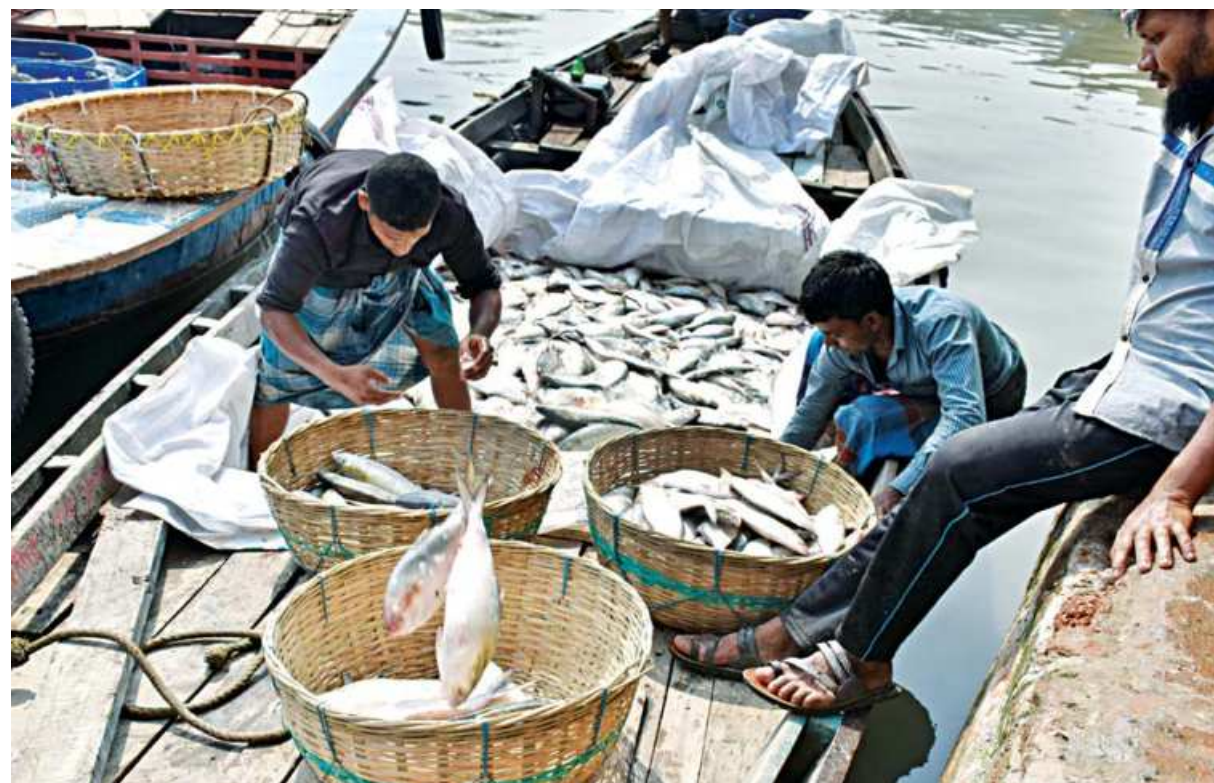
Tonnes of hilsa fish have started streaming into the Barishal Port Road wholesale market. Yesterday was the first day after the 22-day ban on hilsa netting, and the entire market was in jubilant form for the start of the new season.

Meanwhile, at least 2,000 maund hilsa from Kalabadar, Meghna, Arial Kha and Bishkhal rivers were brought to the Port Road hilsa fish wholesale market on Thursday.