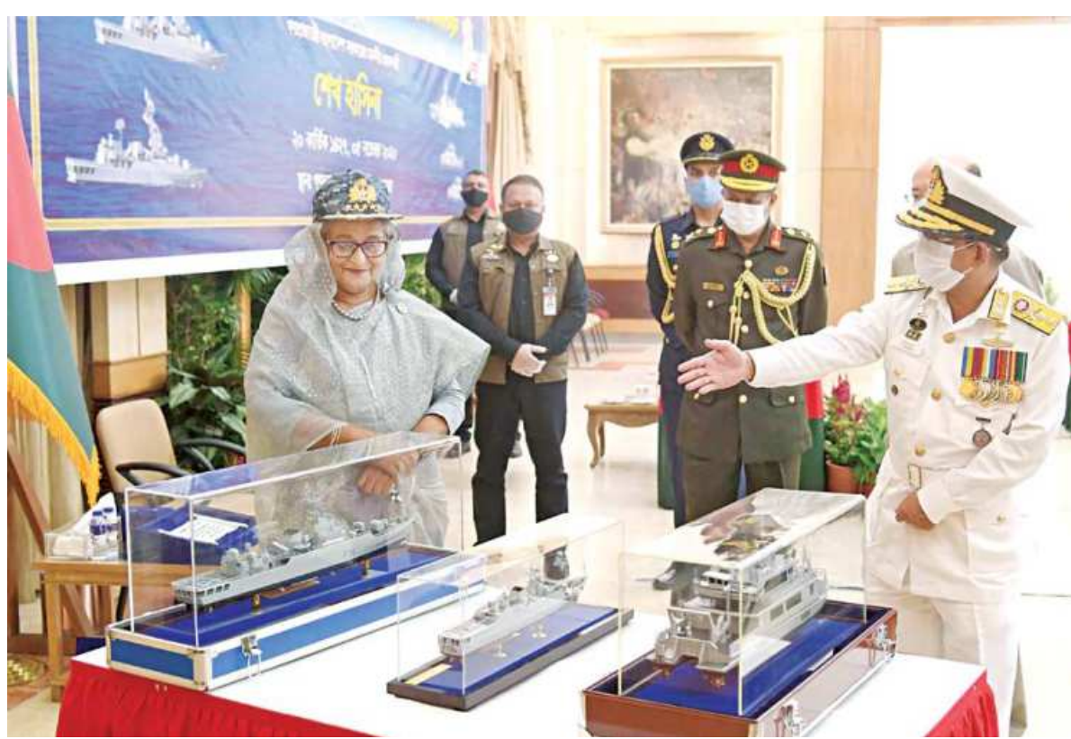
Prime Minister Sheikh Hasina looks at replicas of Bangladesh Navy ships while commissioning five ships, including three warships, through a video conference from the Gono Bhaban yesterday. The warships are: BNS Umar Farooq, BNS Abu Ubaidah, and BNS Protasha. The two survey ships are: BNS Darshak and BNS Tallashi.