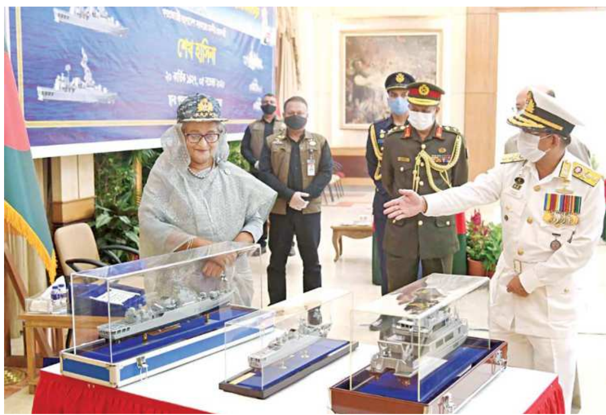
Prime Minister Sheikh Hasina looks at replicas of Bangladesh Navy ships while commissioning five ships, including three warships, through a video conference from the Gono Bhaban yesterday. The warships are: BNS Umar Farooq, BNS Abu Ubaidah, and BNS Protasha. The two survey ships are: BNS Darshak and BNS Tallashi.