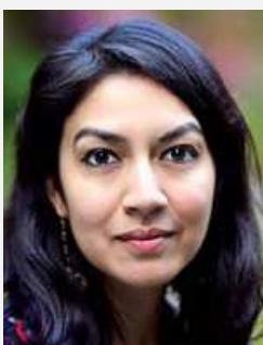
Tahmima Anam, author