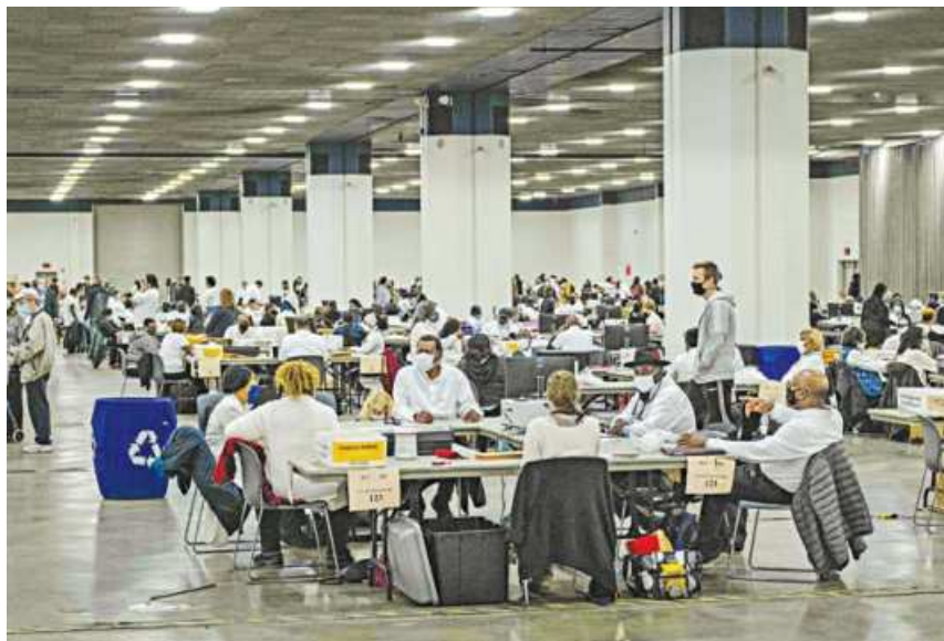
Ballots are counted at the TCF Center in Detroit, Michigan yesterday. Mail-in ballots were causing a long wait for results in key battlegrounds states.