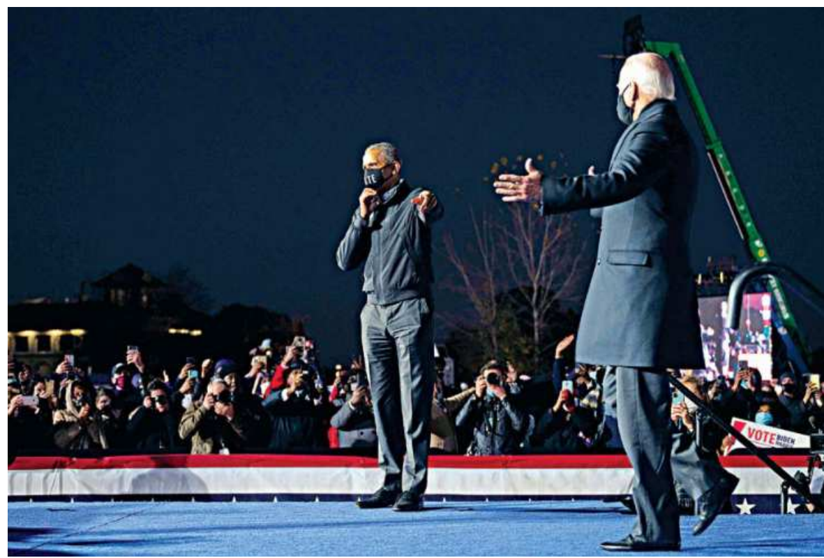
Former US President Barack Obama introduces Democratic Presidential candidate and former US Vice President Joe Biden during a mobilization event at Belle Isle Casino in Detroit, Michigan, on Saturday.