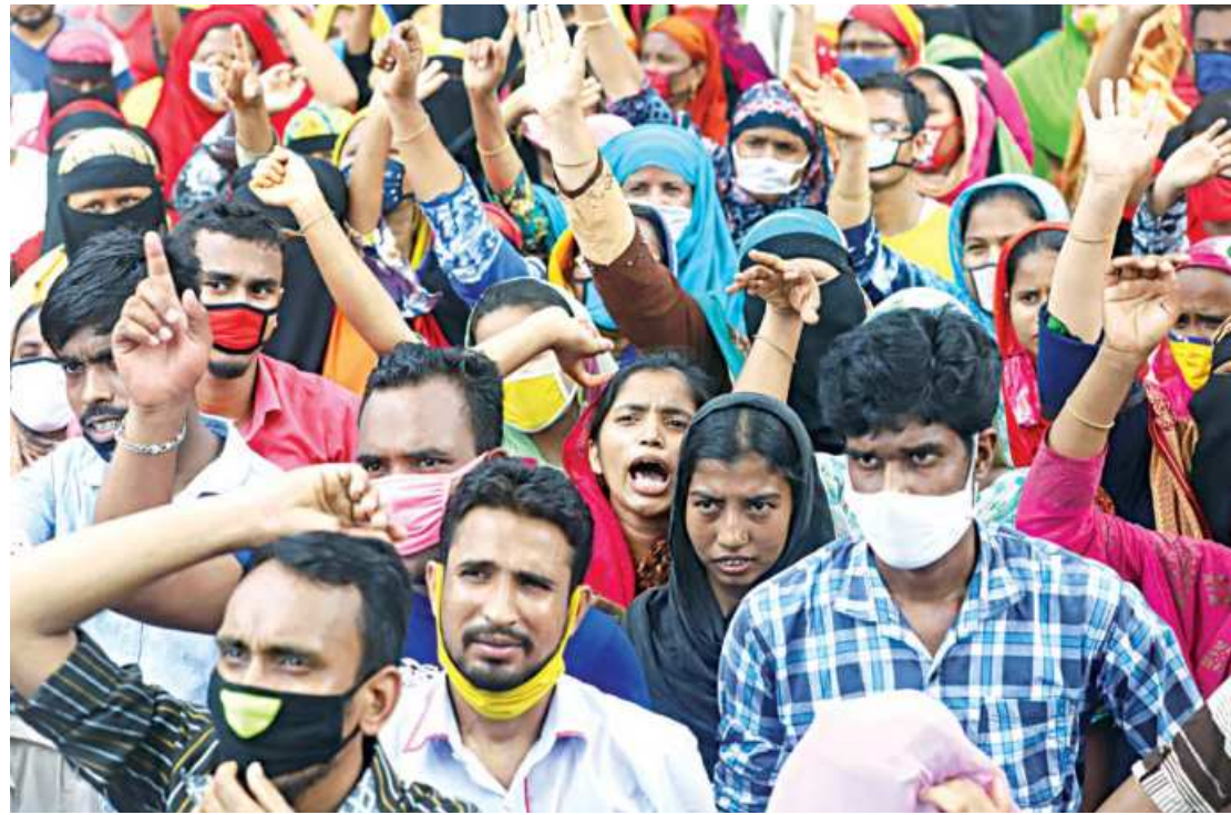
Due to the pandemic, there are reasons to be concerned about employment and food security in the garment sector, experts think.