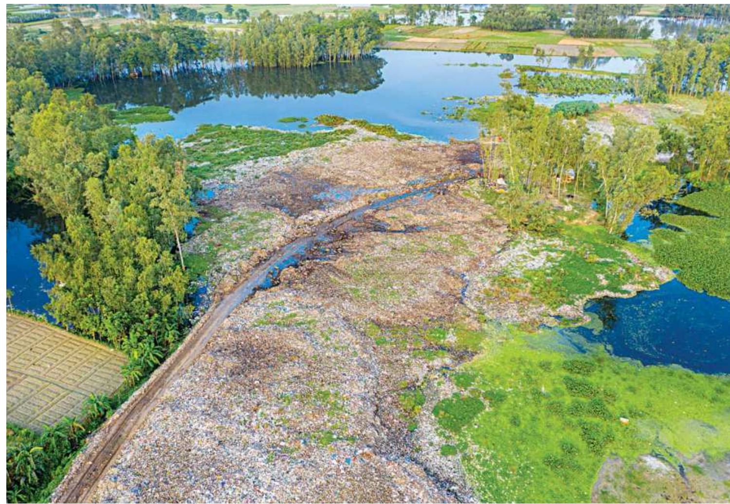
A large amount of garbage floating on the Korotoa river as Bogura City Corporation and an NGO named Thengamara Mohila Sabuj Sangha (TMSS) dump waste right beside the river. Around 4,000 people in the area were suffering badly for this unplanned and illegal dumping.