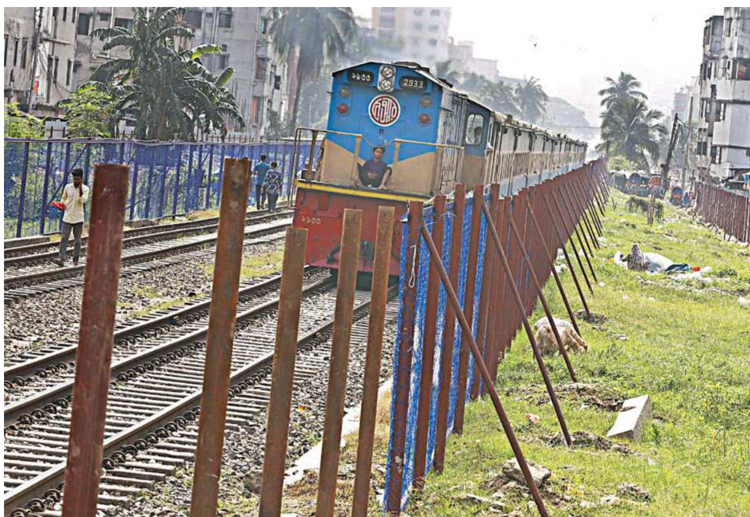
As the construction work of elevated expressway is about to begin, the authorities concerned put up safety fences beside rail lines to avert unwanted entries and accidents. The photo was taken in the capital's Nakhhalpara area yesterday.