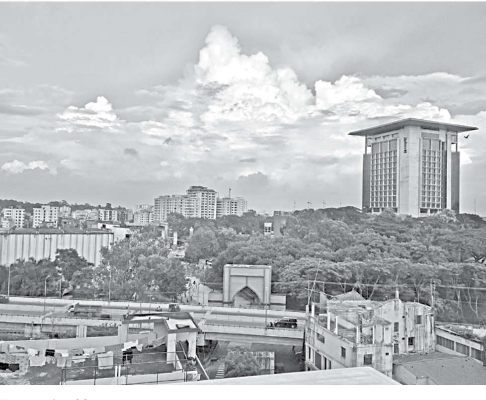
The port city of Chattogram.

its complicated "melting-pot" racial history, its multi-faith social amalgamation, its history of anti-British movement, its Porto Grande global attraction through the ages, among others. Uncharacteristic mountainous terrain in a predominantly flat deltaic country has always been an essential part of the city's mythology. The Chinese traveller poet Hsuan Tsang's 7th-century depiction of the city as "a sleeping beauty emerging from mists and water" was no doubt a reference to Chattogram's hilly idyll.