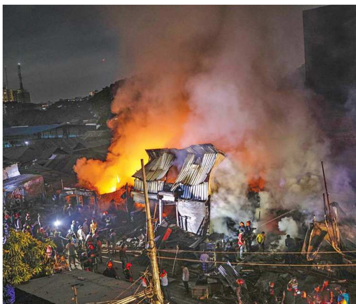
Shanties burn as firefighters and locals try to douse the flames in Kalyanpur slum in Dhaka late Friday night. At least 40 dwellings were gutting in the fire. More on page 3.