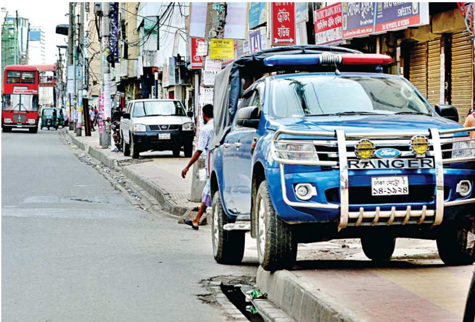
A police pickup truck and another vehicle are parked on the pavement on Kazi Nazrul Islam Avenue near Karwan Bazar in the capital yesterday. The vehicles obstruct pedestrians on a street that has been narrowed down due to the construction work for metro rail.