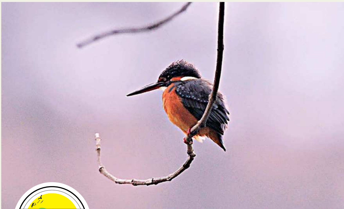
A kingfisher spotted on a tree branch beside a lake on Jahangirnagar University campus ready to pounce on fish. The bird, which has a large head, long, sharp, pointed bill, short legs, and stubby tail, usually lives near rivers and eats fish.