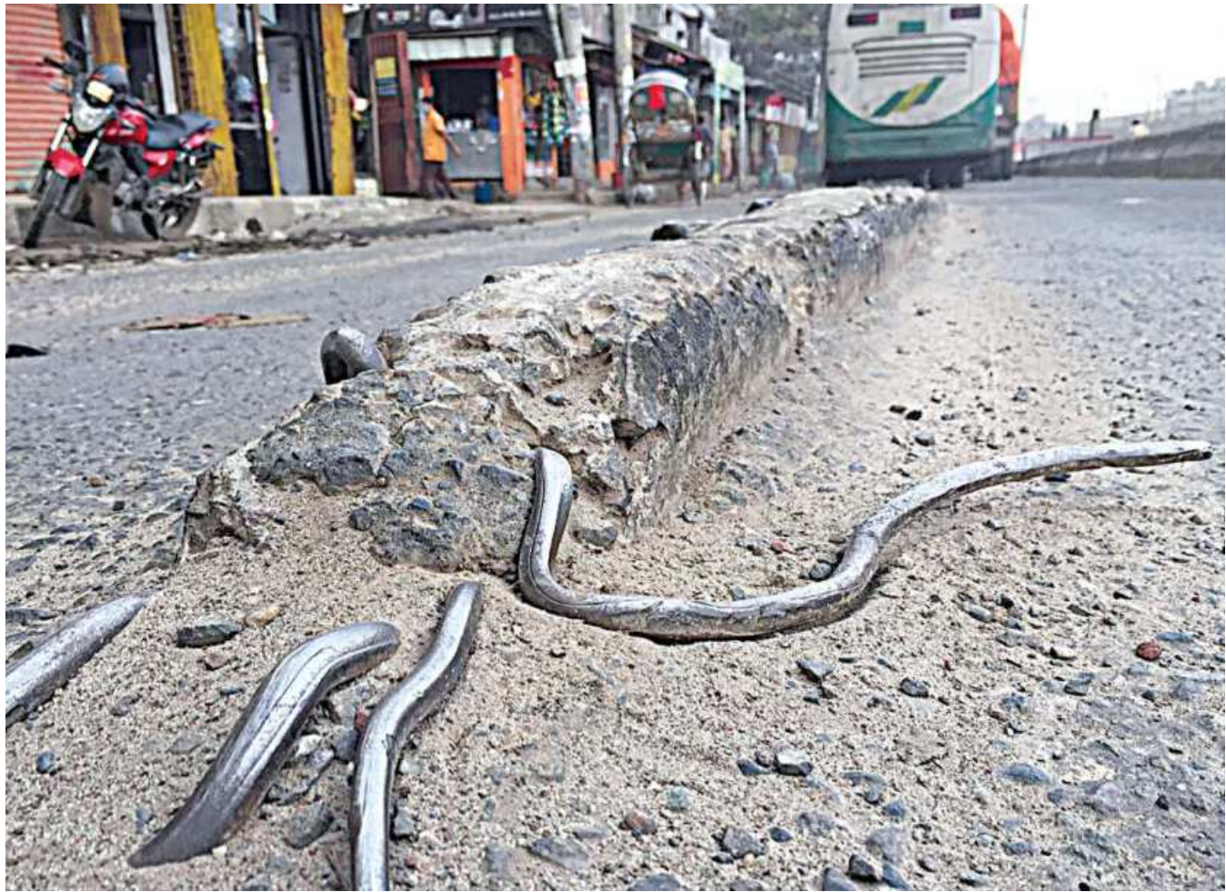
The road median under the jurisdiction of Mayor Hanif flyover in the capital's East Jatrahari has been in this state for a long time. Shopkeepers in the area said accidents often occur there when vehicles go over the unmarked median that has rods sticking out. This photo was taken yesterday.