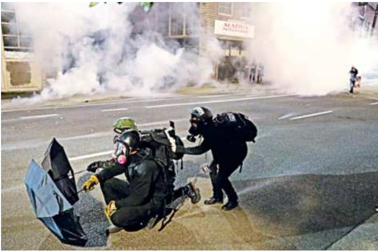
Demonstrators clash with Federal and Portland police at an Immigration and Customs Enforcement facility in Portland, Oregon, US, yesterday.

Of the deceased, one each was from Mymensingh and Barishal divisions, three were from Sylhet, five from Chattogram and 15 were from Dhaka division.