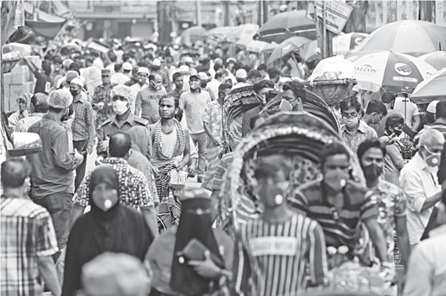
File photo of people crowding the Dhupkhola Bazar in Dhaka, on April 8, 2020.

more street space to make safer roads, promote sustainable development goals, and provide carbon-free mobility. For instance, Berlin is using tapes and mobile markers to create quick “pop-up” cycle lanes, and has listed cycle service shops as an essential service. The mayor of Paris, Anne Hidalgo, is planning to convert it into a “15-minute city” to ensure it takes no longer than 15 minutes for the residents to get to work, move around to shop or take children to school. London is also prioritising bikes as a safe mode of transport for commuters. Just as the pandemic has triggered a revolution in cycling around Europe, Bangladesh can also follow a similar strategy by encouraging cycling and introducing dedicated cycle lanes in city streets like those recently introduced in Dhaka's Agargaon area.